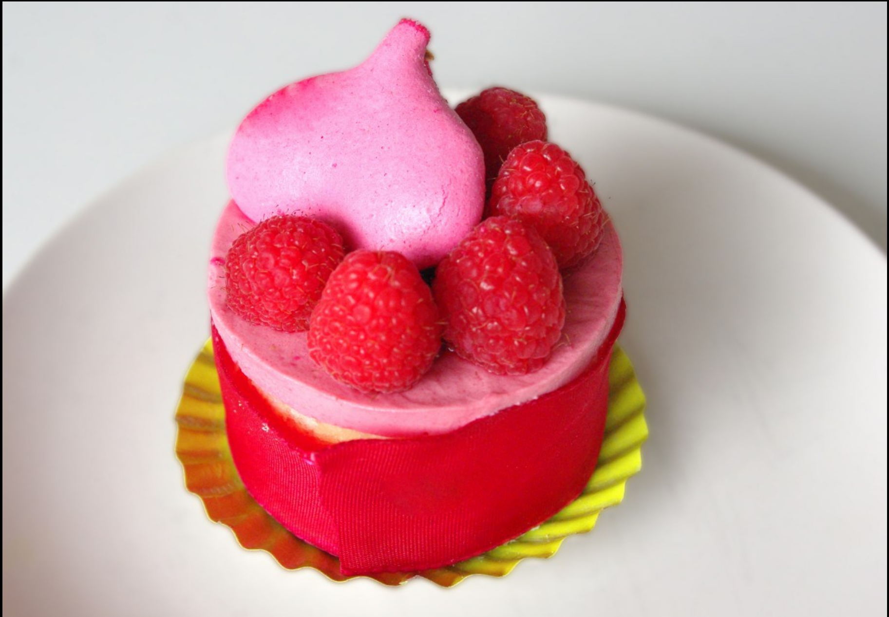
French pâtisserie for Valentine's Day