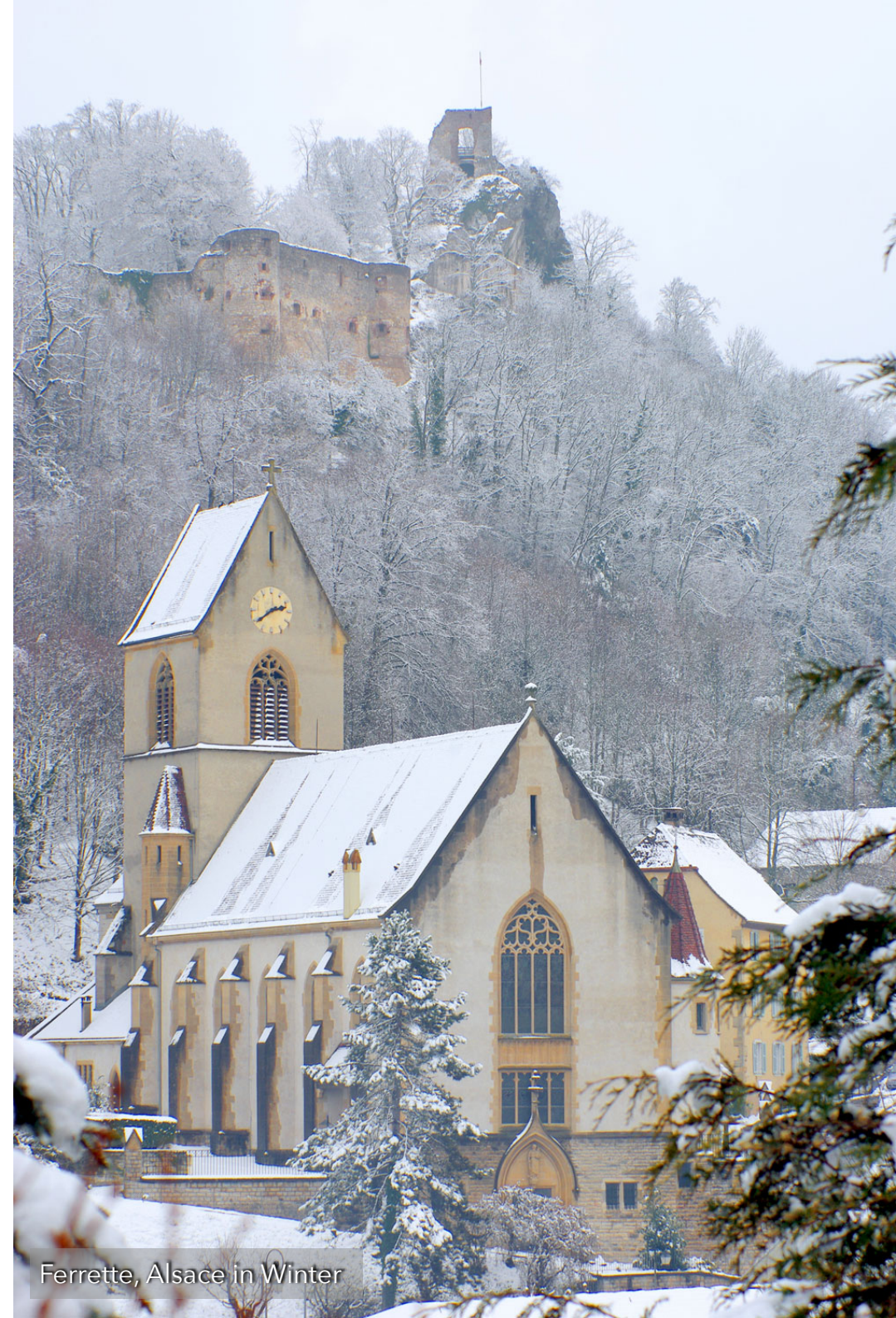
Ferrette, Alsace in Winter

With the start of Winter comes the festive season of Christmas and New Year, commonly referred to in French as "les fêtes de fin d'années".