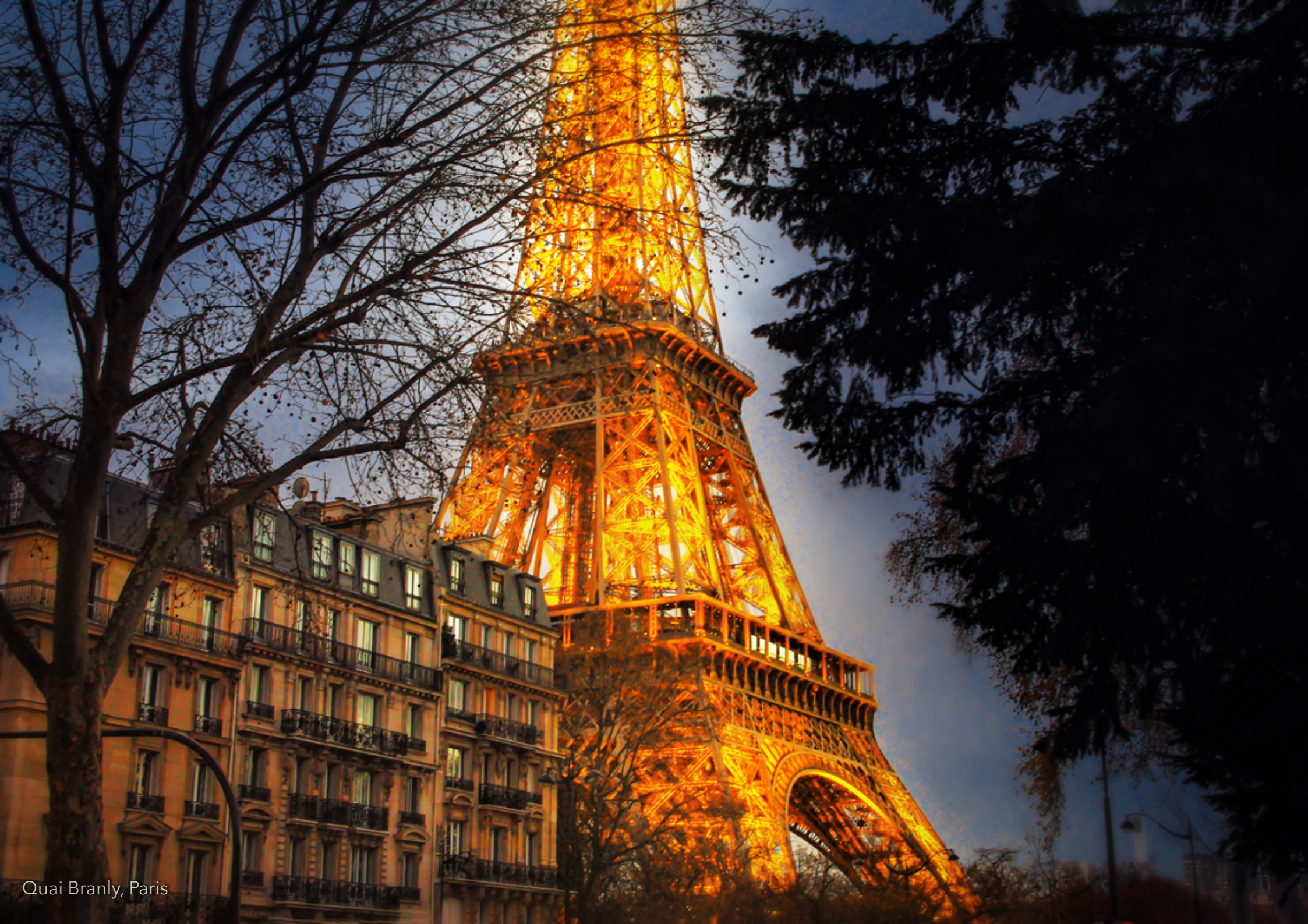
Quai Branly, Paris