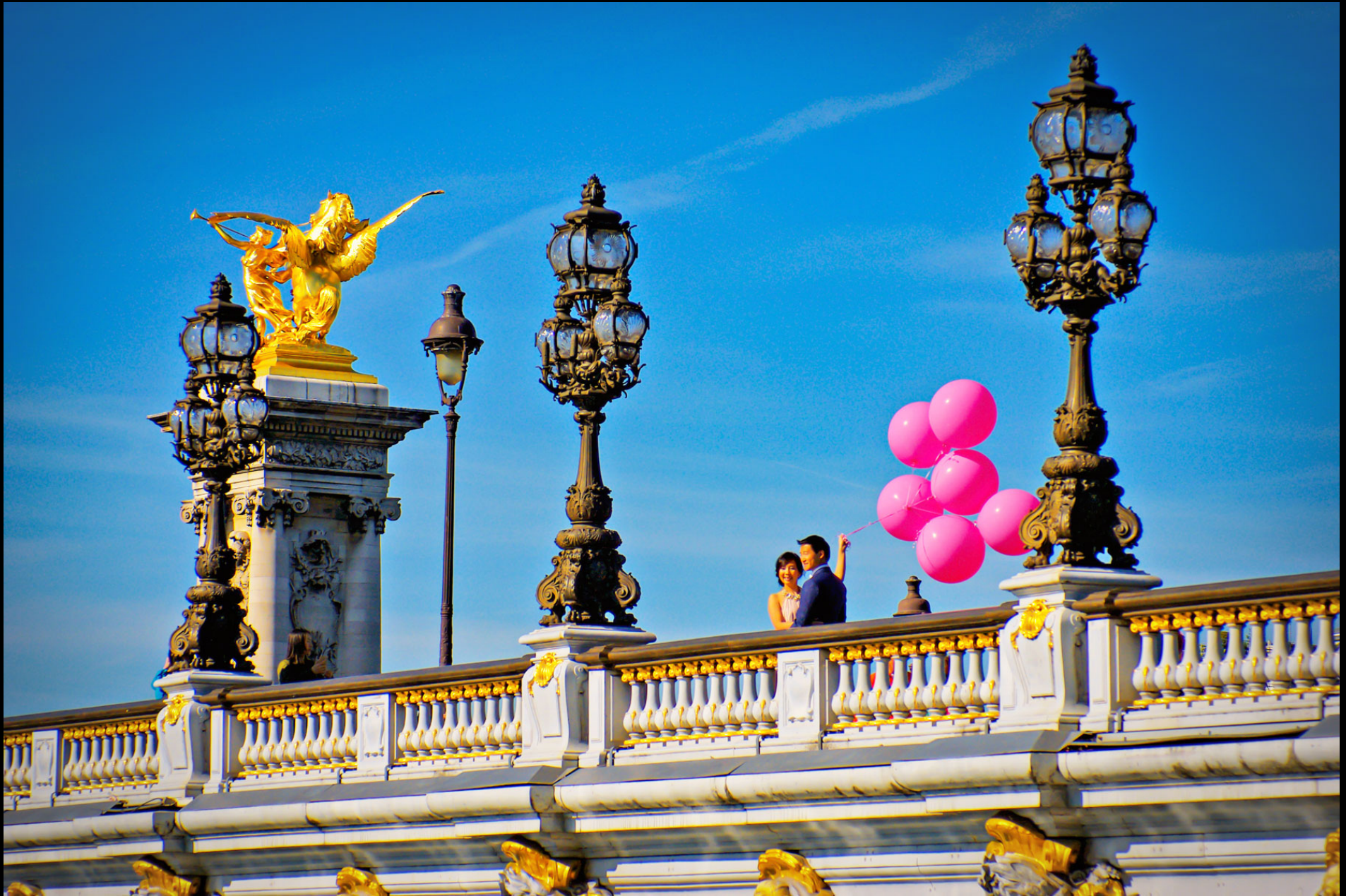
Pont Alexandre III, Paris