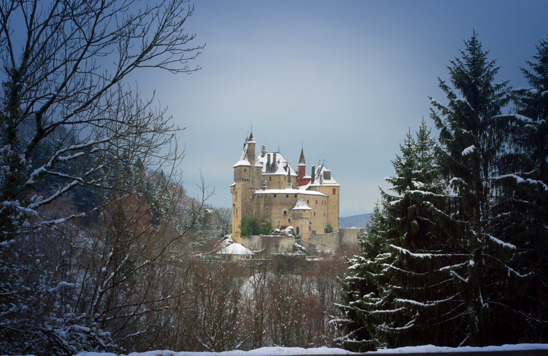
Castle of Menthon-Saint-Bernard, French Alps of Haute-Savoie