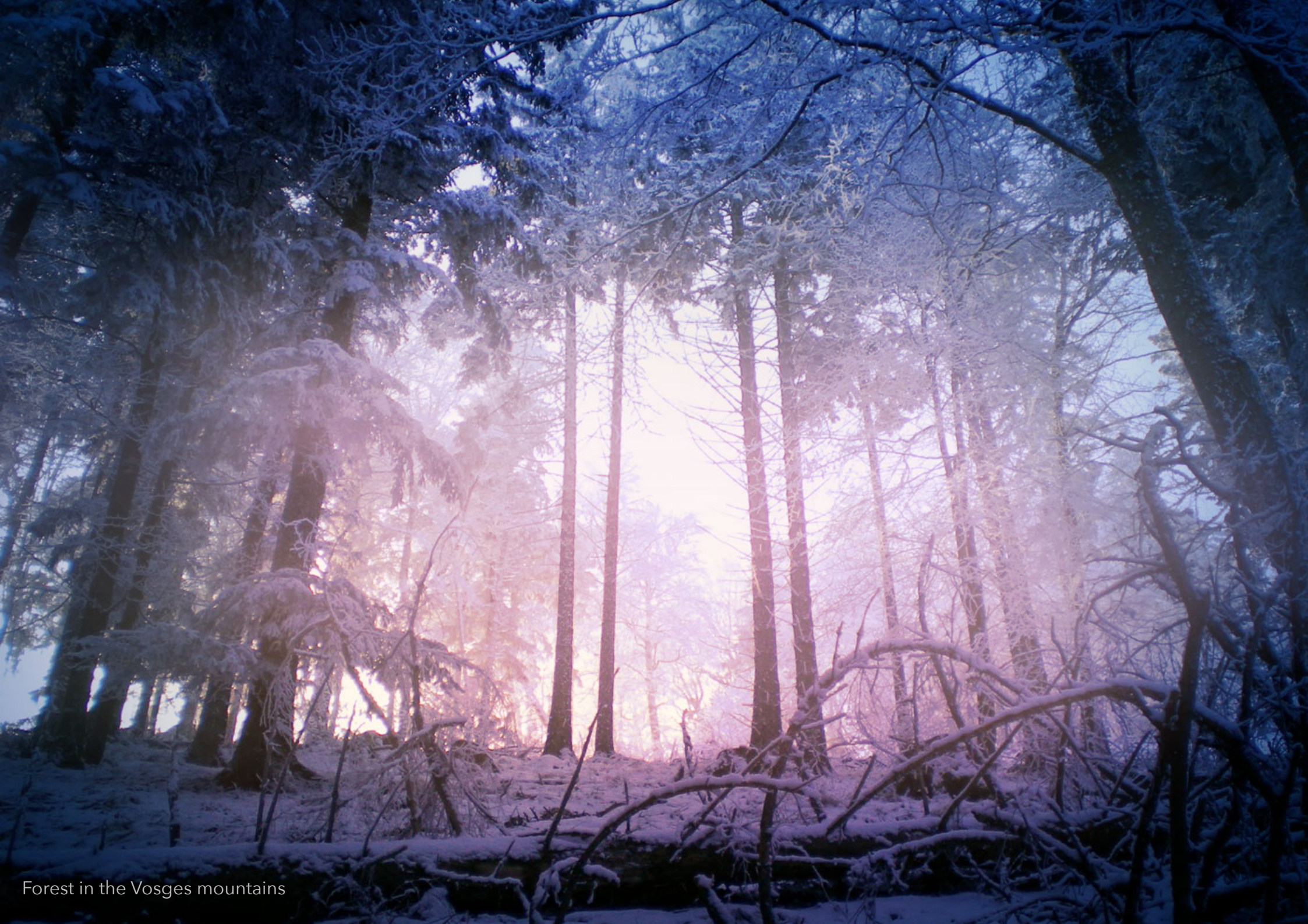
Forest in the Vosges mountains