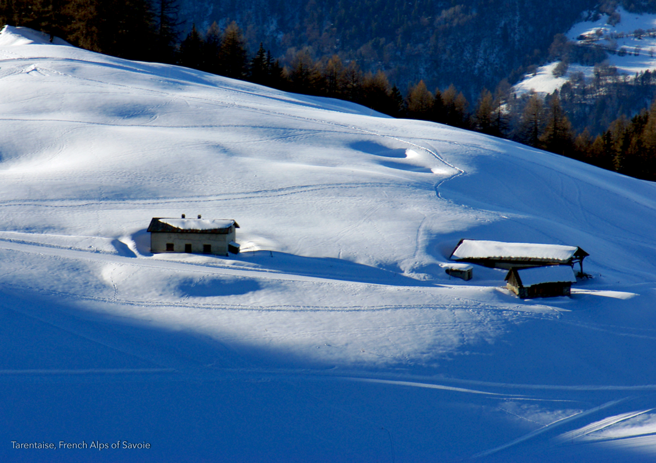
Tarentaise, French Alps of Savoie