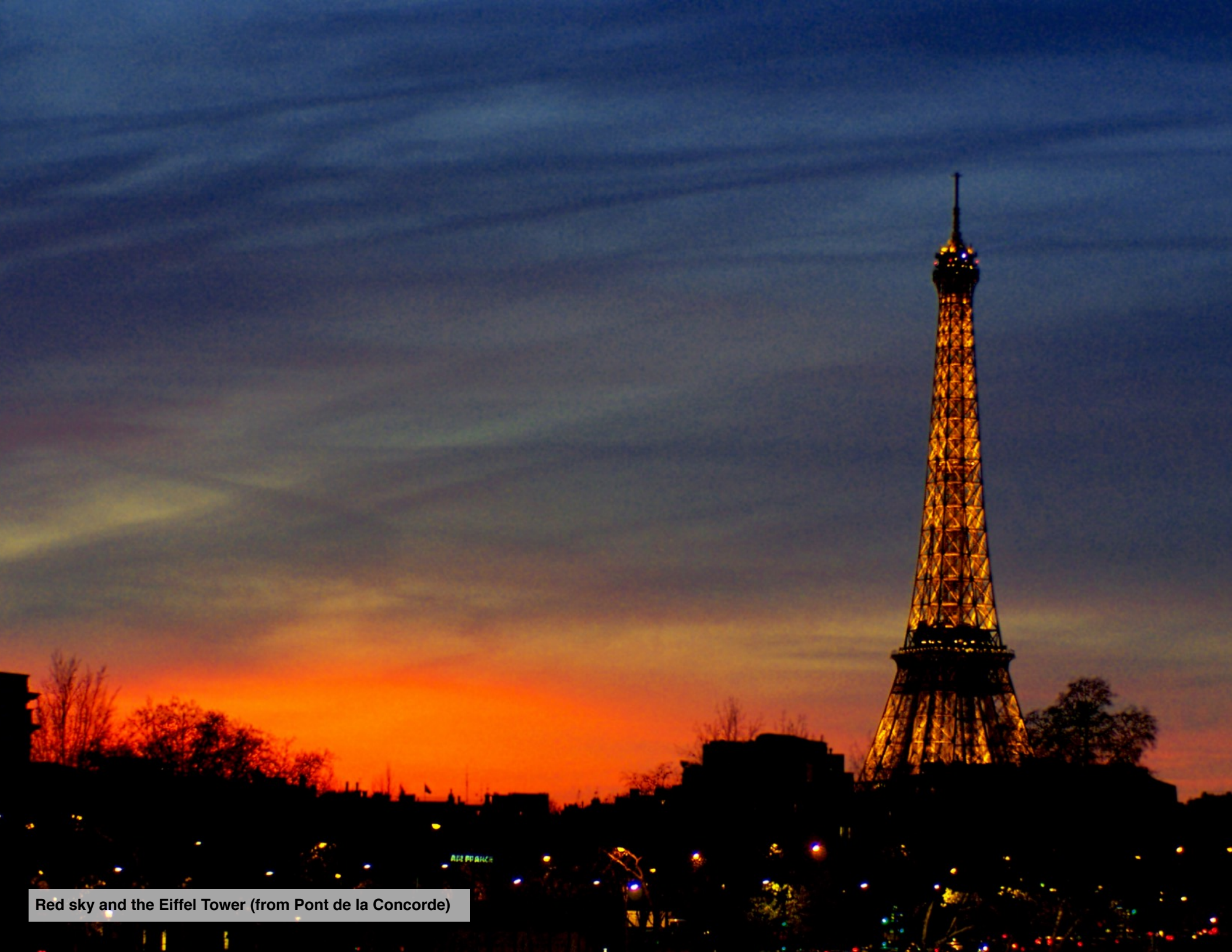
Red sky and the Eiffel Tower (from Pont de la Concorde)