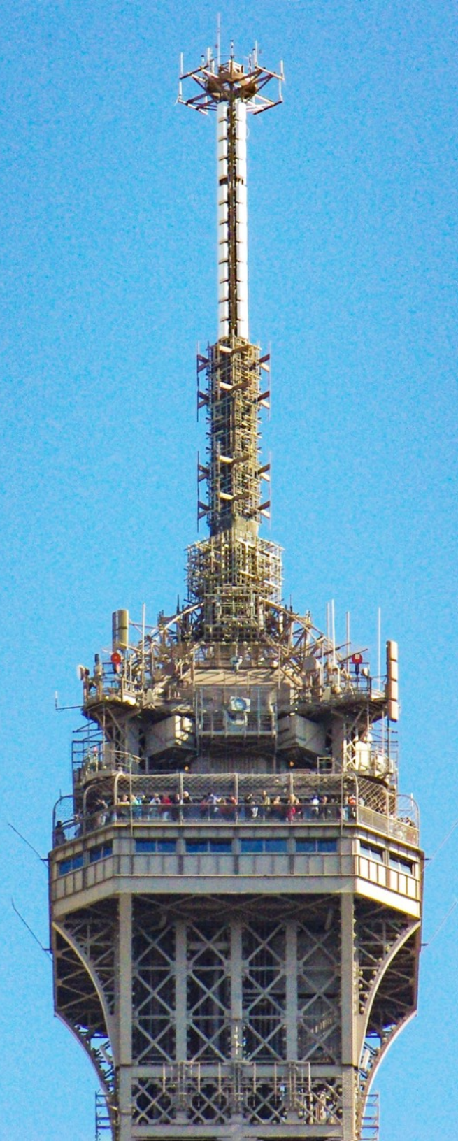
The third floor of the Eiffel Tower