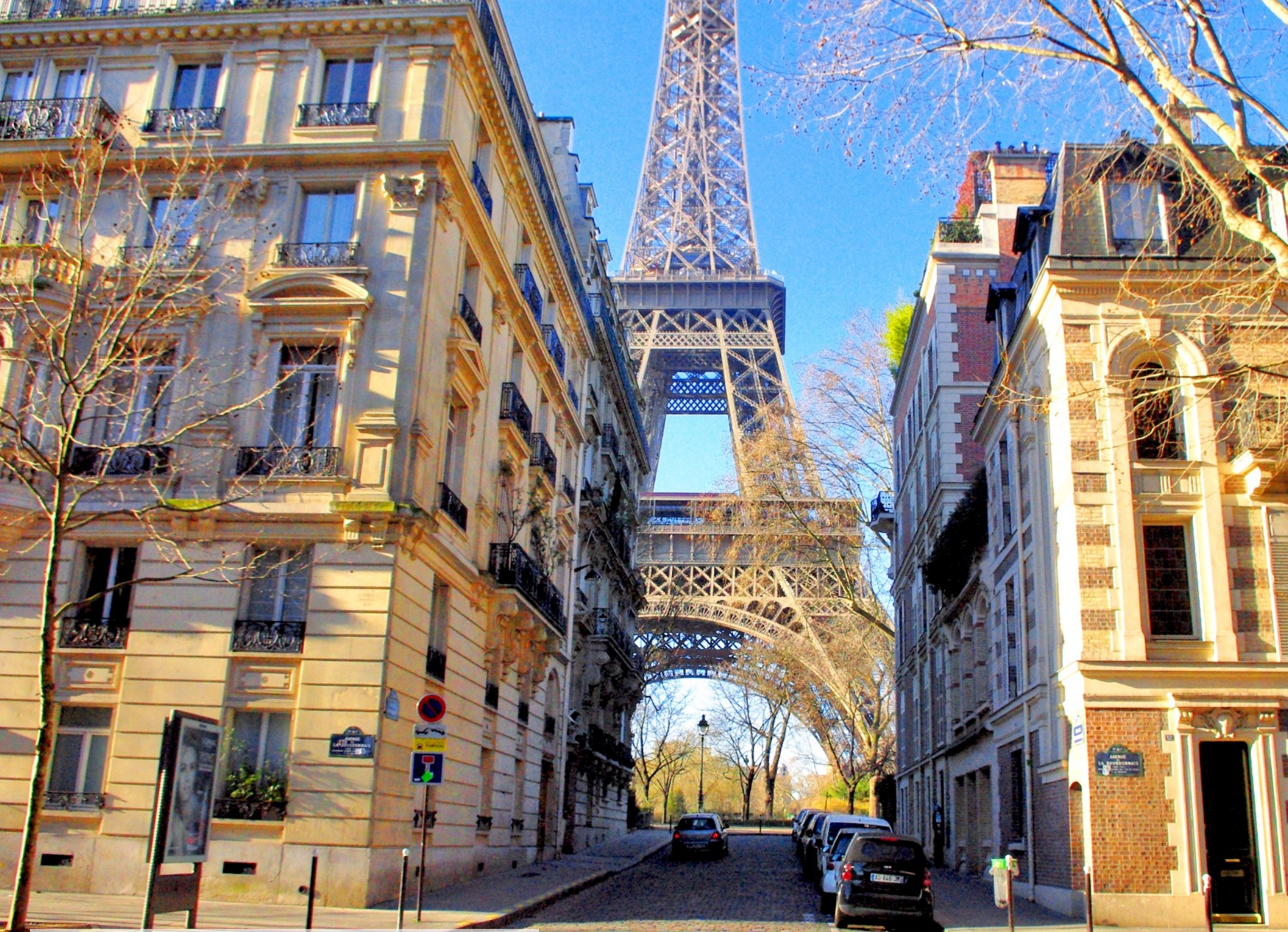
The Eiffel Tower seen from Avenue de la Bourdonnais in Winter