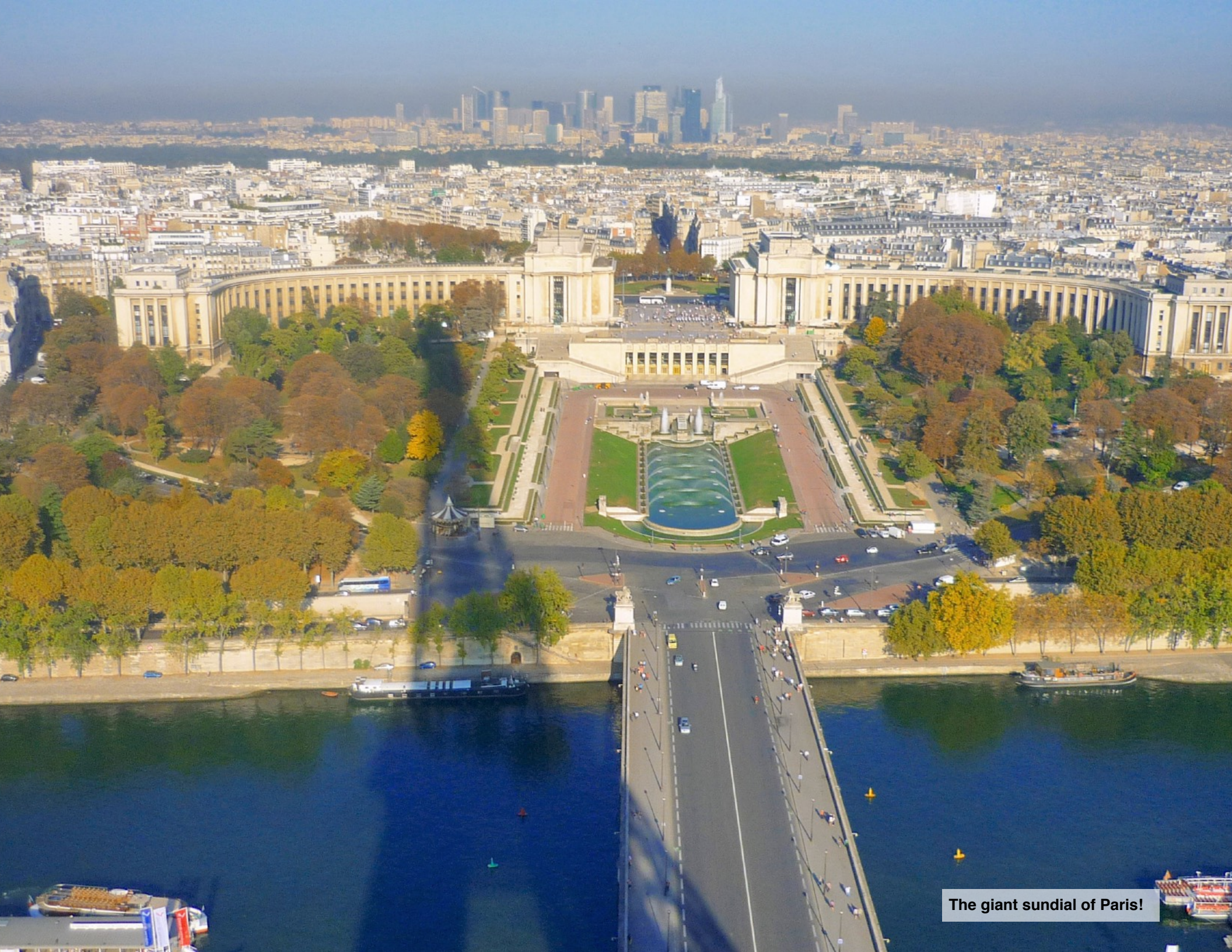
The giant sundial of Paris!