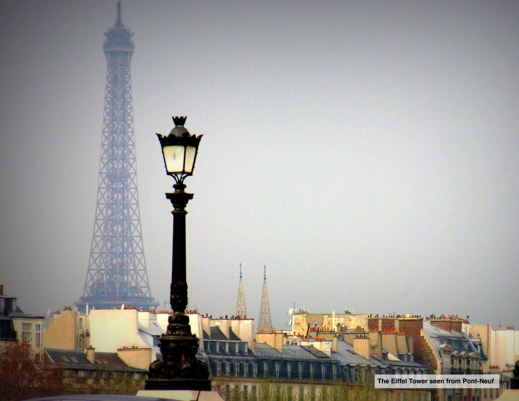
The Eiffel Tower seen from Pont-Neuf