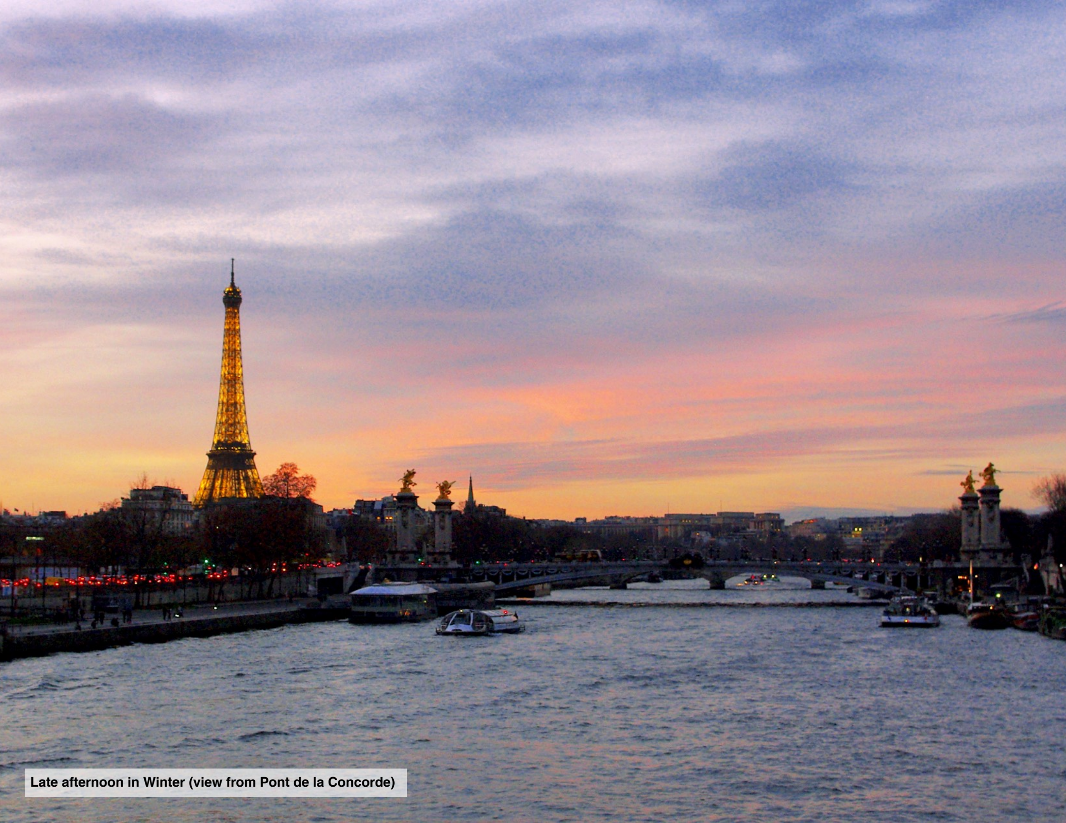
Late afternoon in Winter (view from Pont de la Concorde)