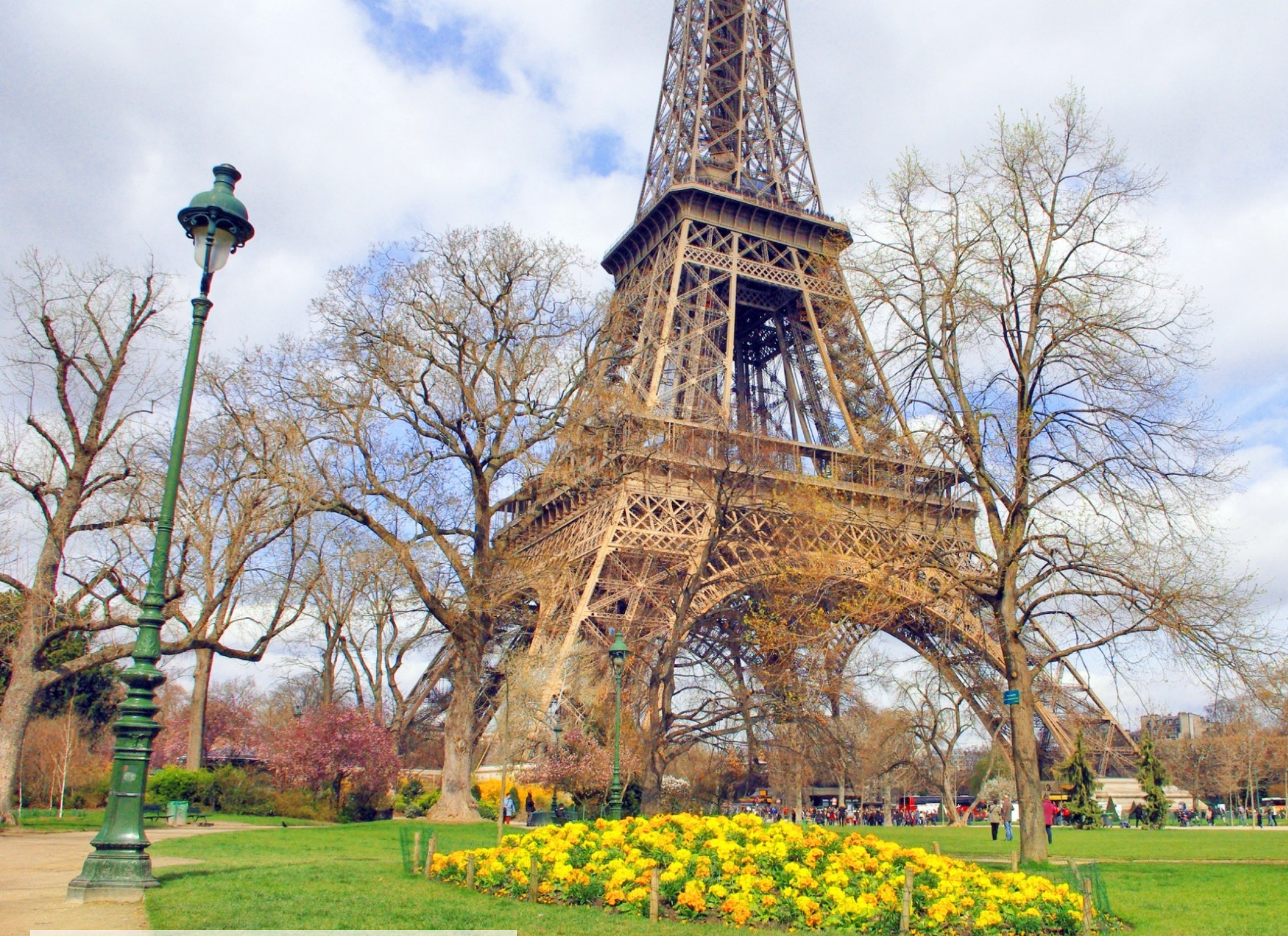
The Champ de Mars in March! (this time with yellow flowers!)