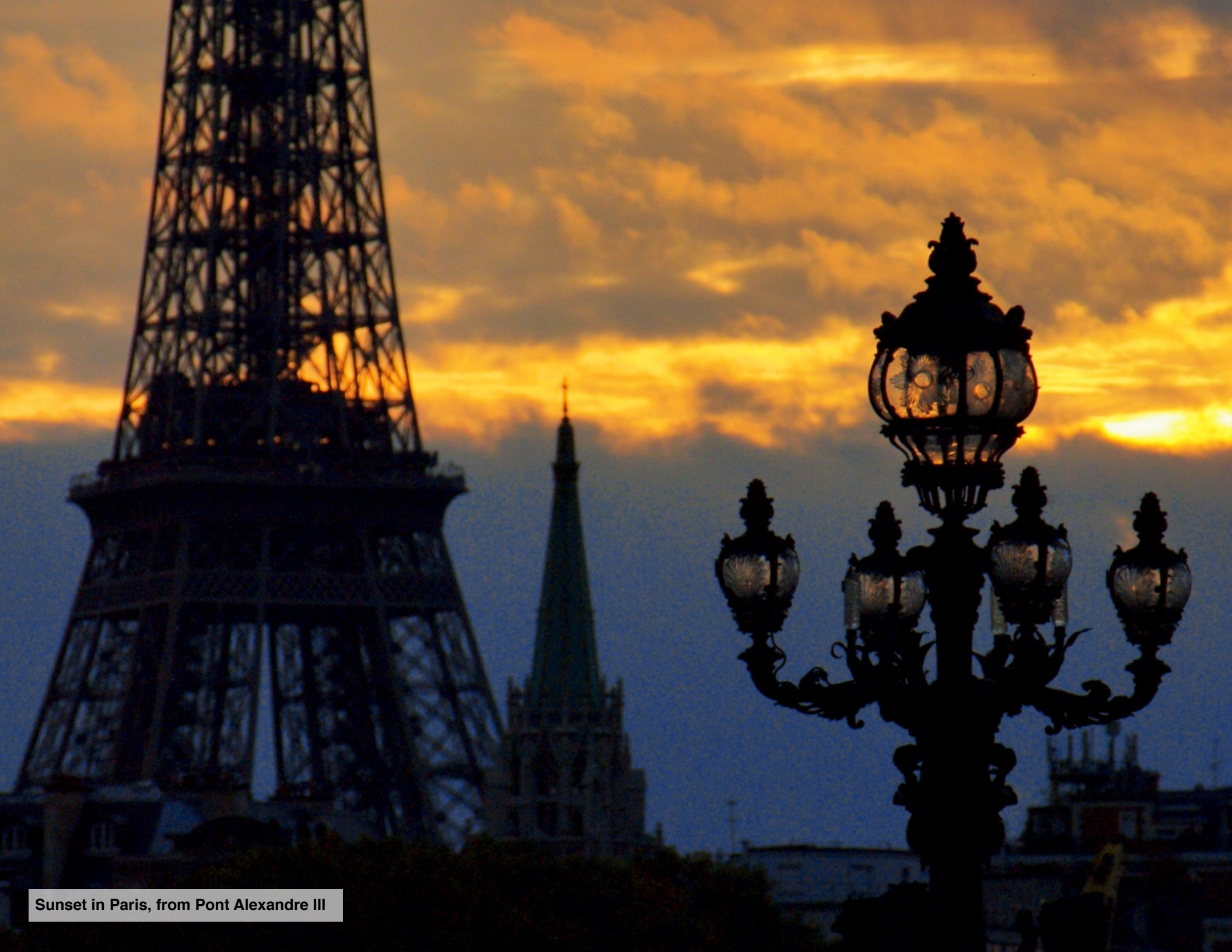
Sunset in Paris, from Pont Alexandre III