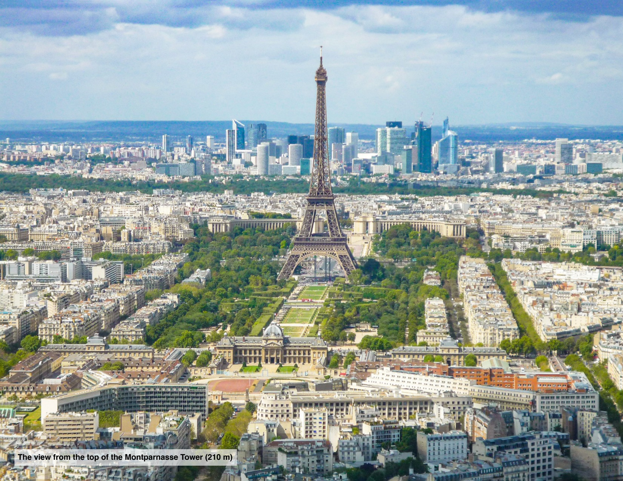
The view from the top of the Montparnasse Tower (210 m)