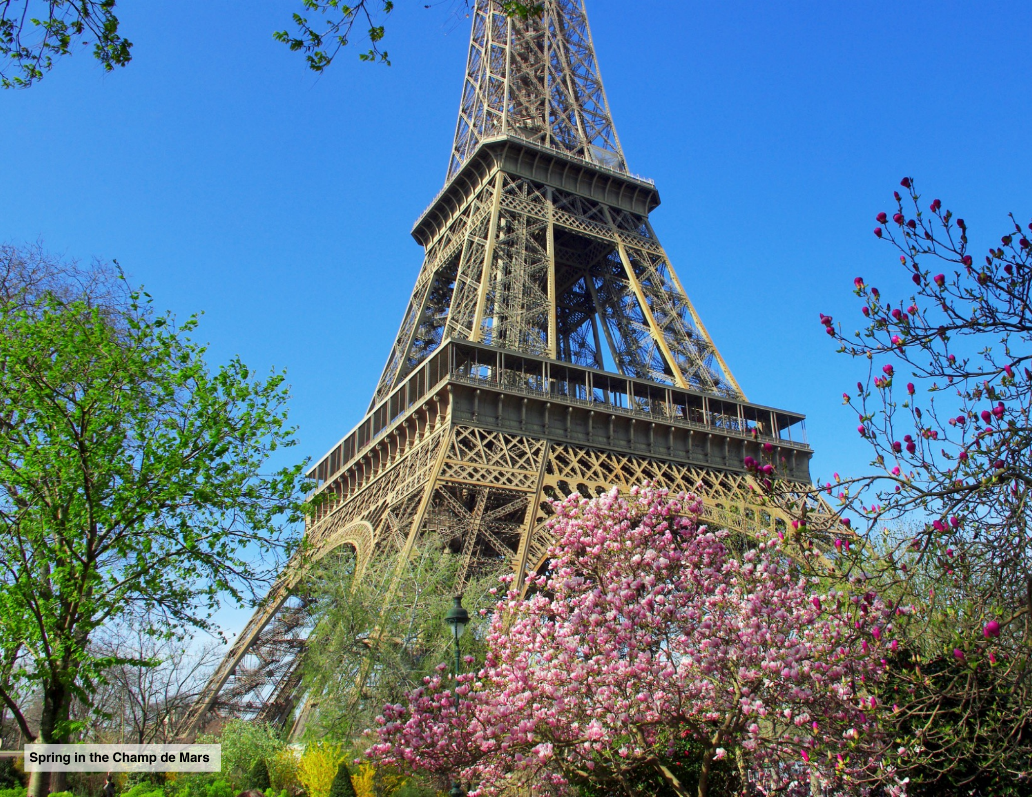
Spring in the Champ de Mars