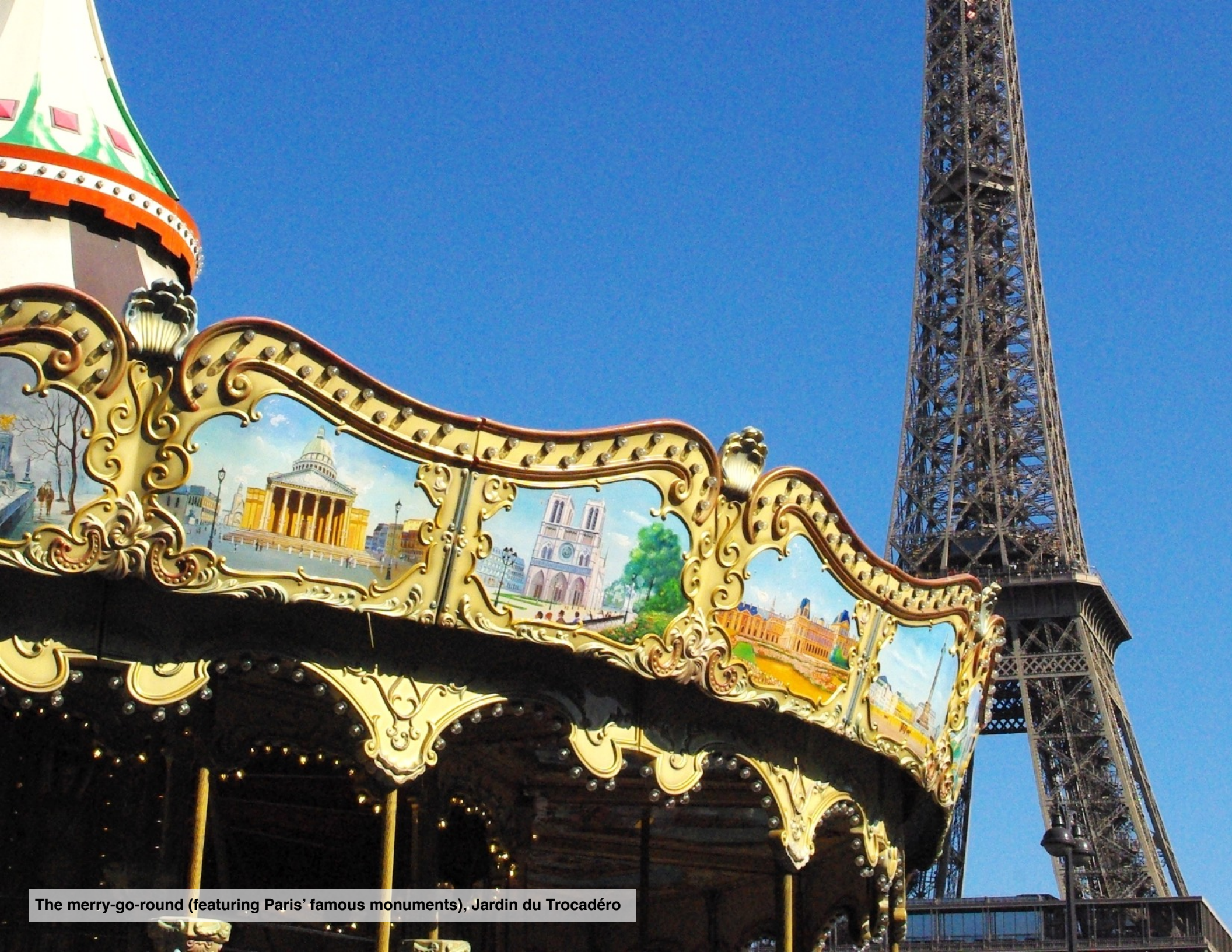
The merry-go-round (featuring Paris' famous monuments), Jardin du Trocadéro