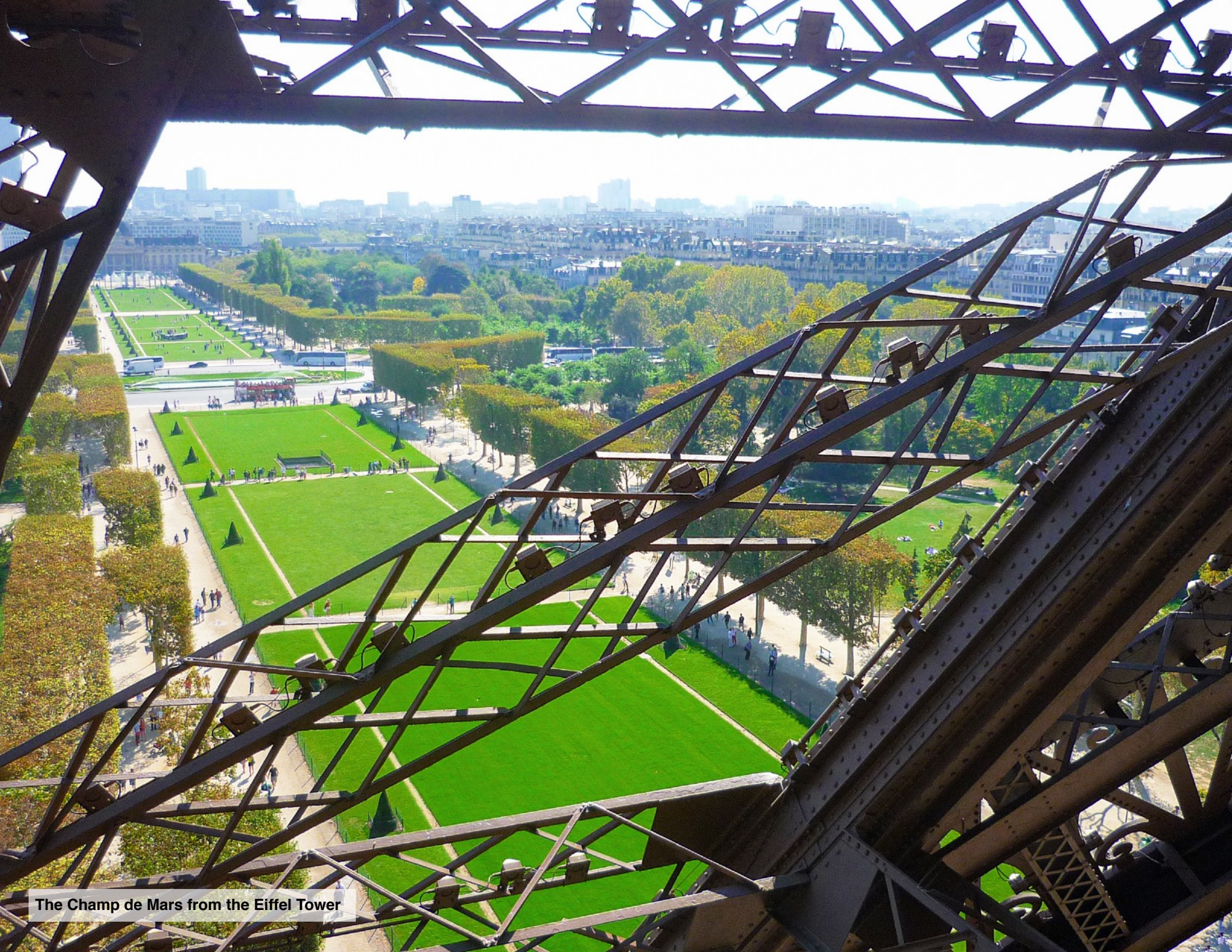
The Champ de Mars from the Eiffel Tower