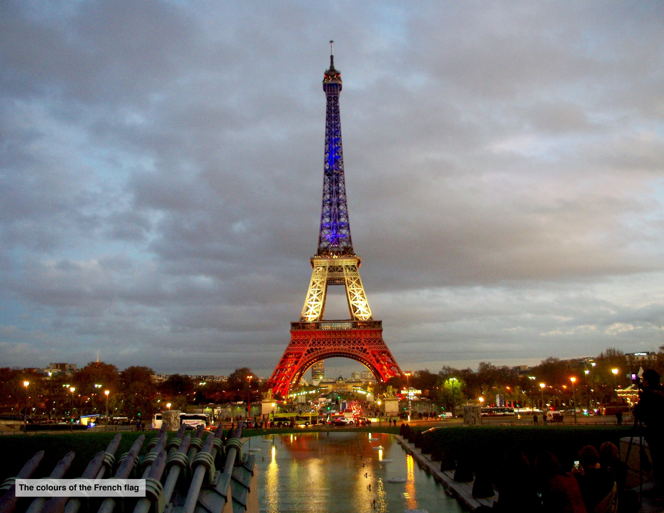
The colours of the French flag