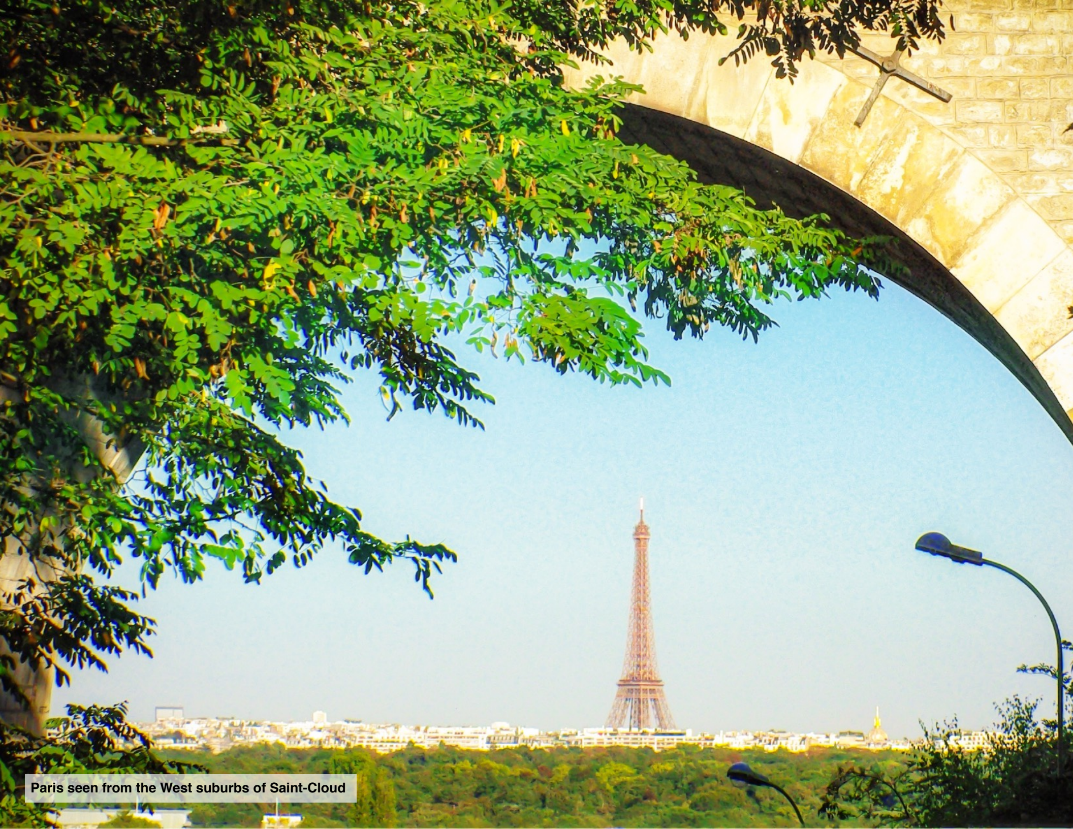
Paris seen from the West suburbs of Saint-Cloud