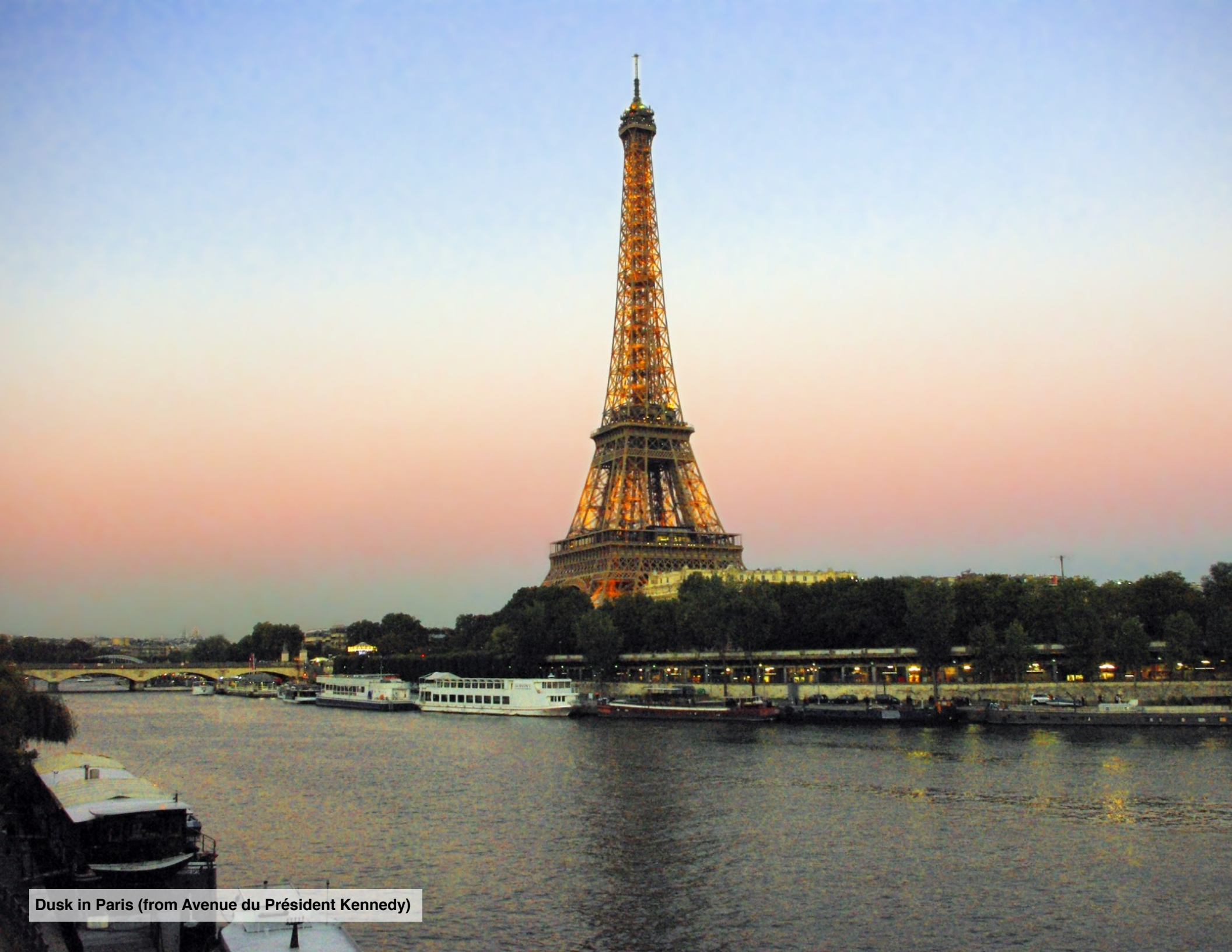
Dusk in Paris (from Avenue du Président Kennedy)