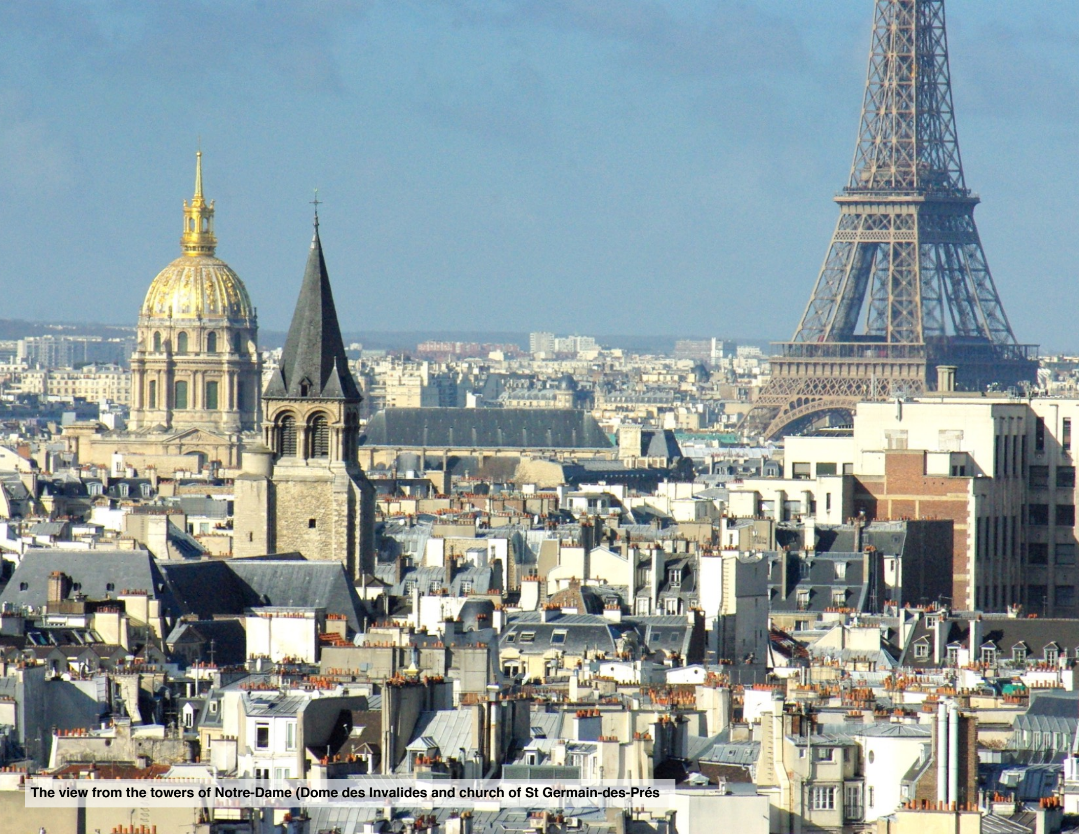
The view from the towers of Notre-Dame (Dome des Invalides and church of St Germain-des-Prés