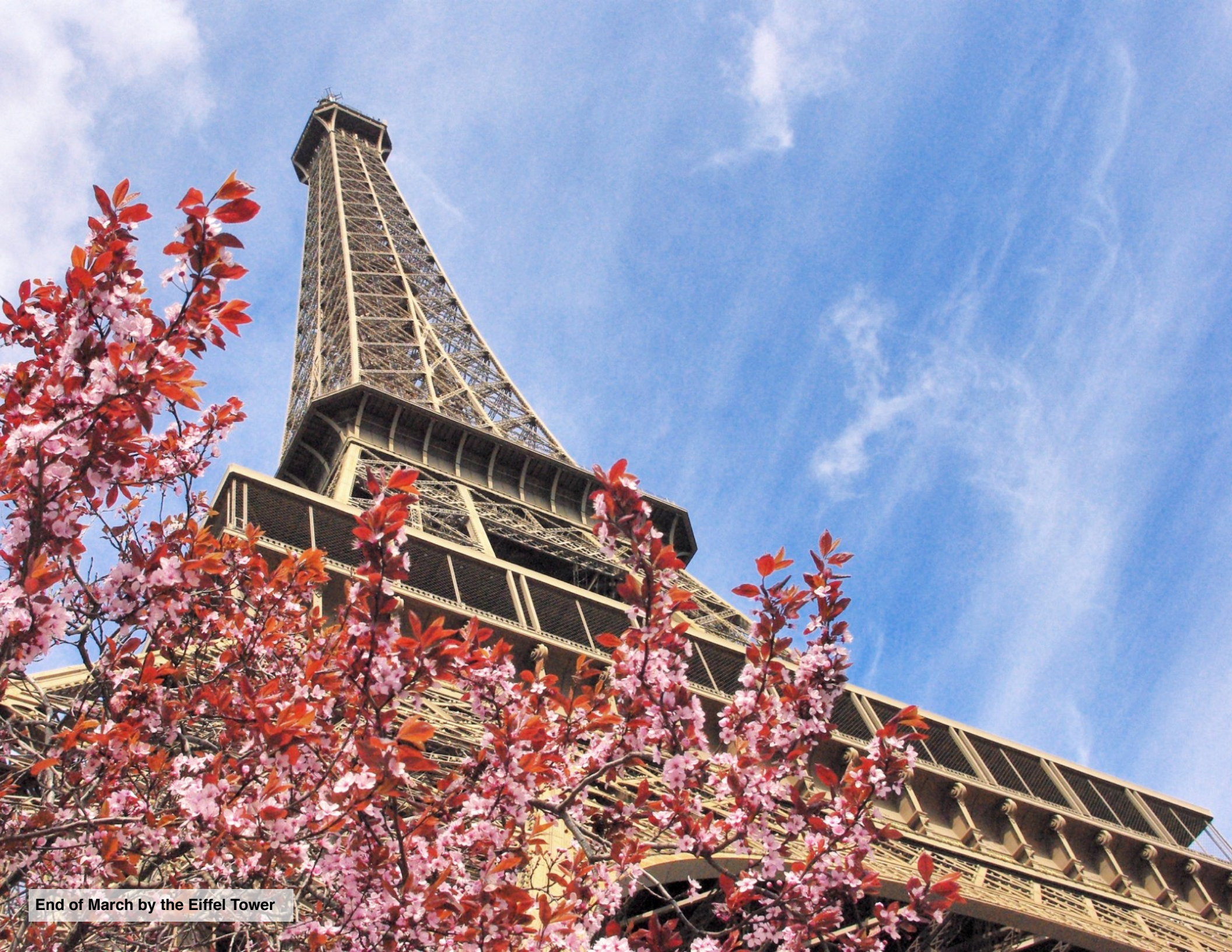
End of March by the Eiffel Tower