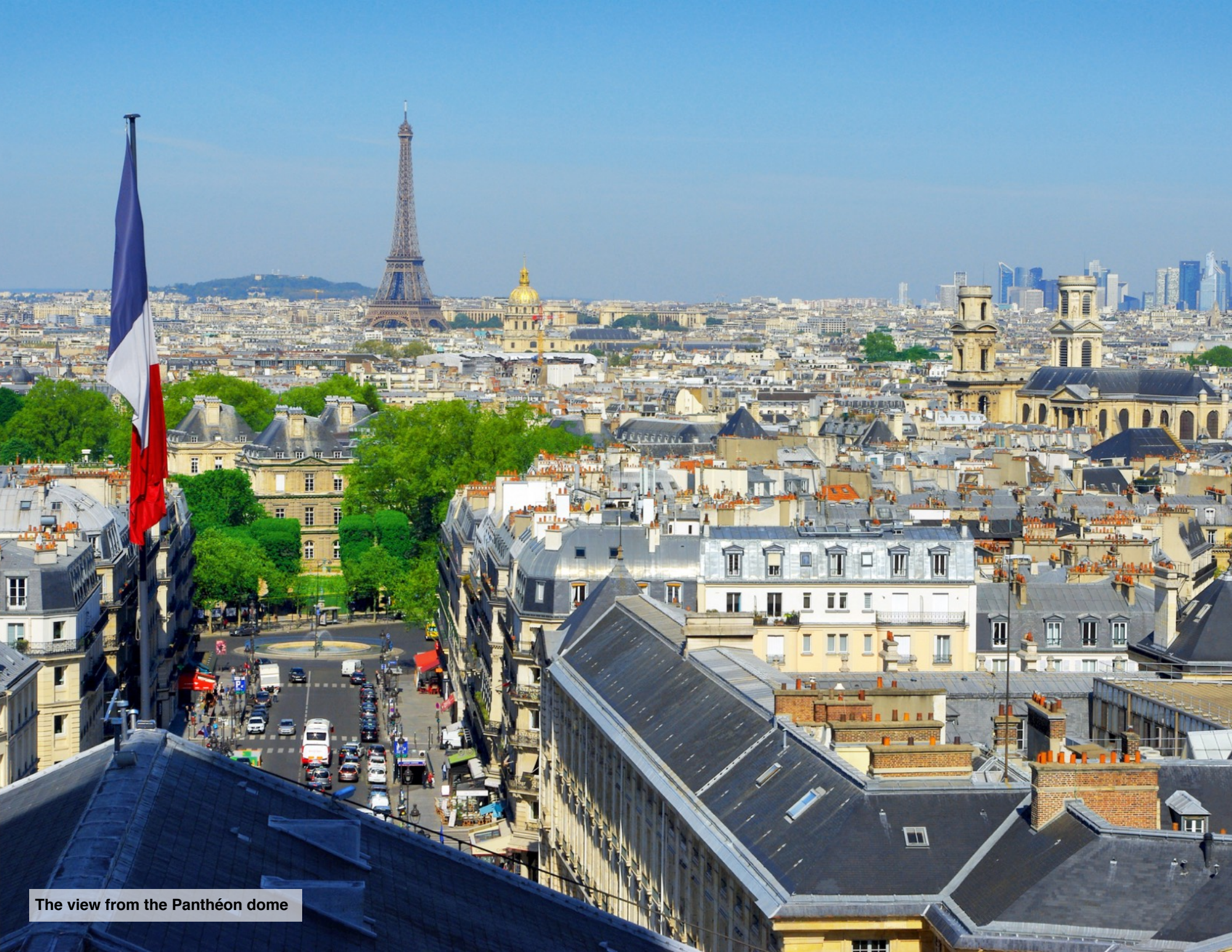
The view from the Panthéon dome