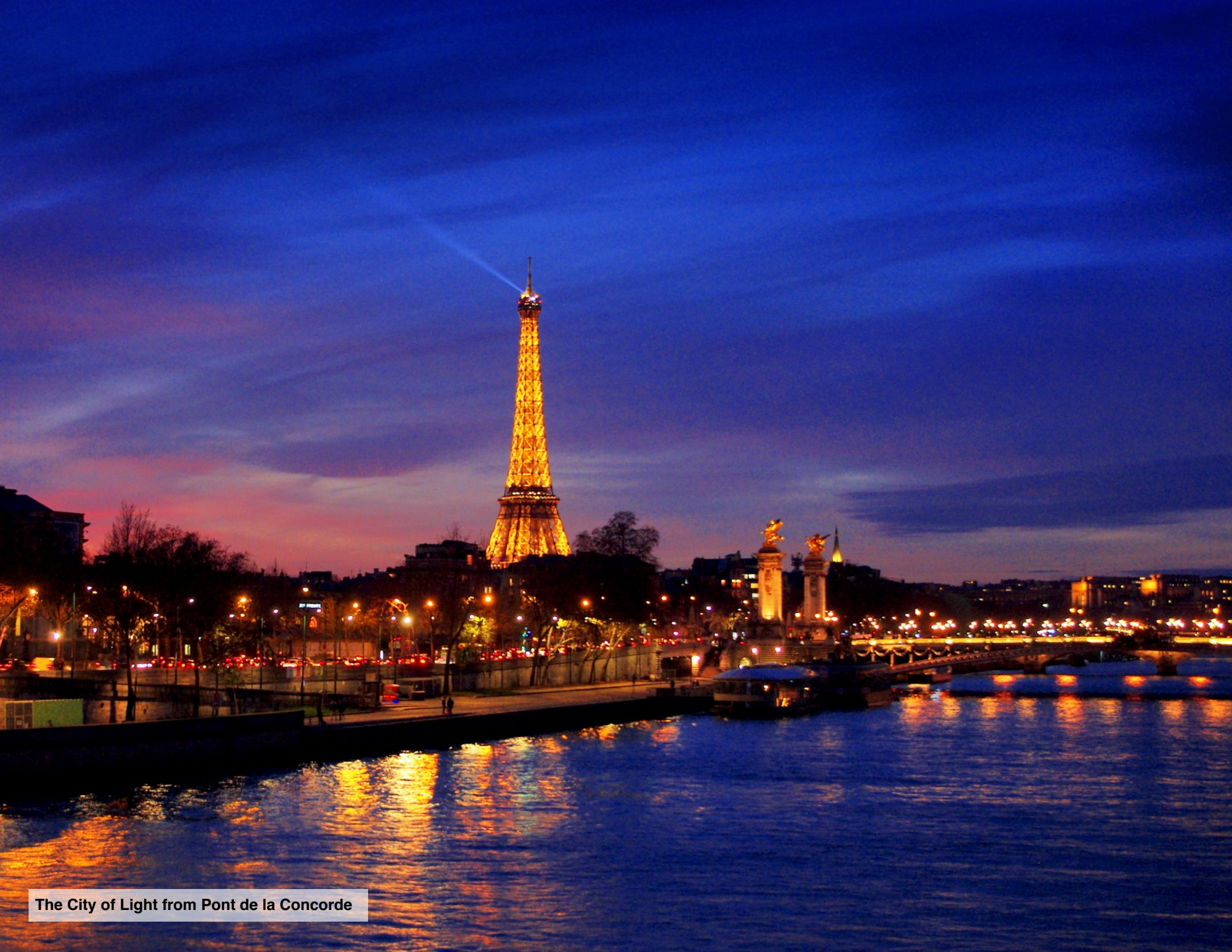
The City of Light from Pont de la Concorde