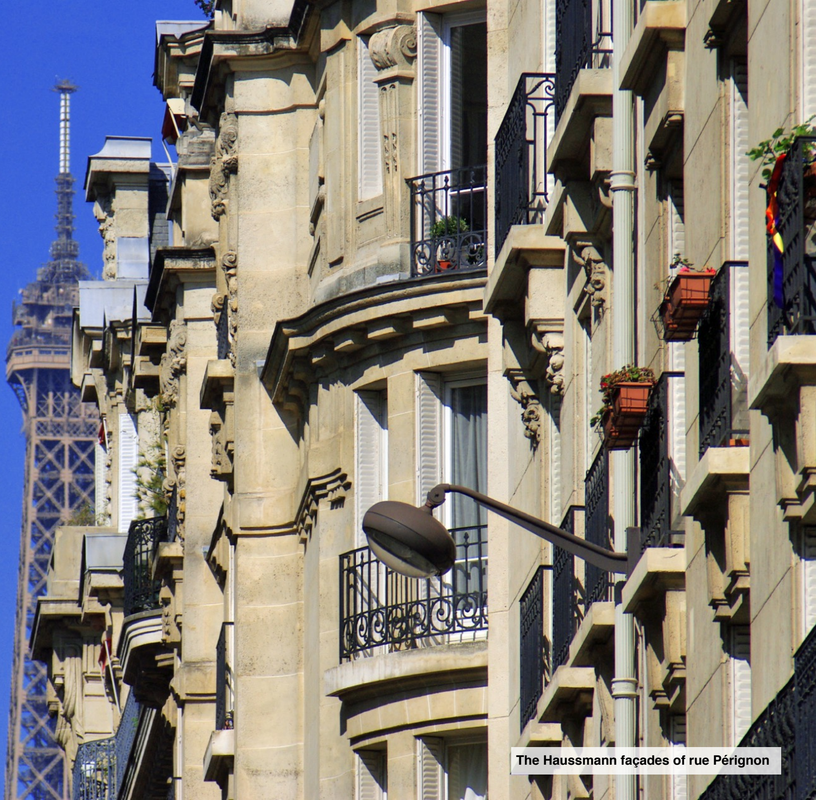
The Haussmann façades of rue Pérignon