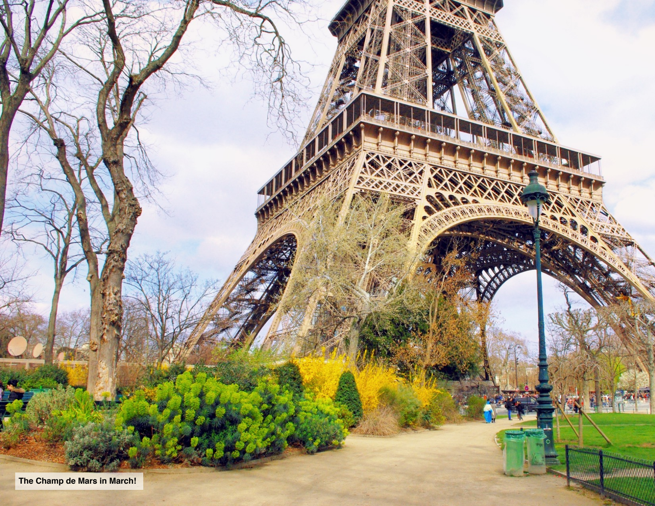
The Champ de Mars in March!