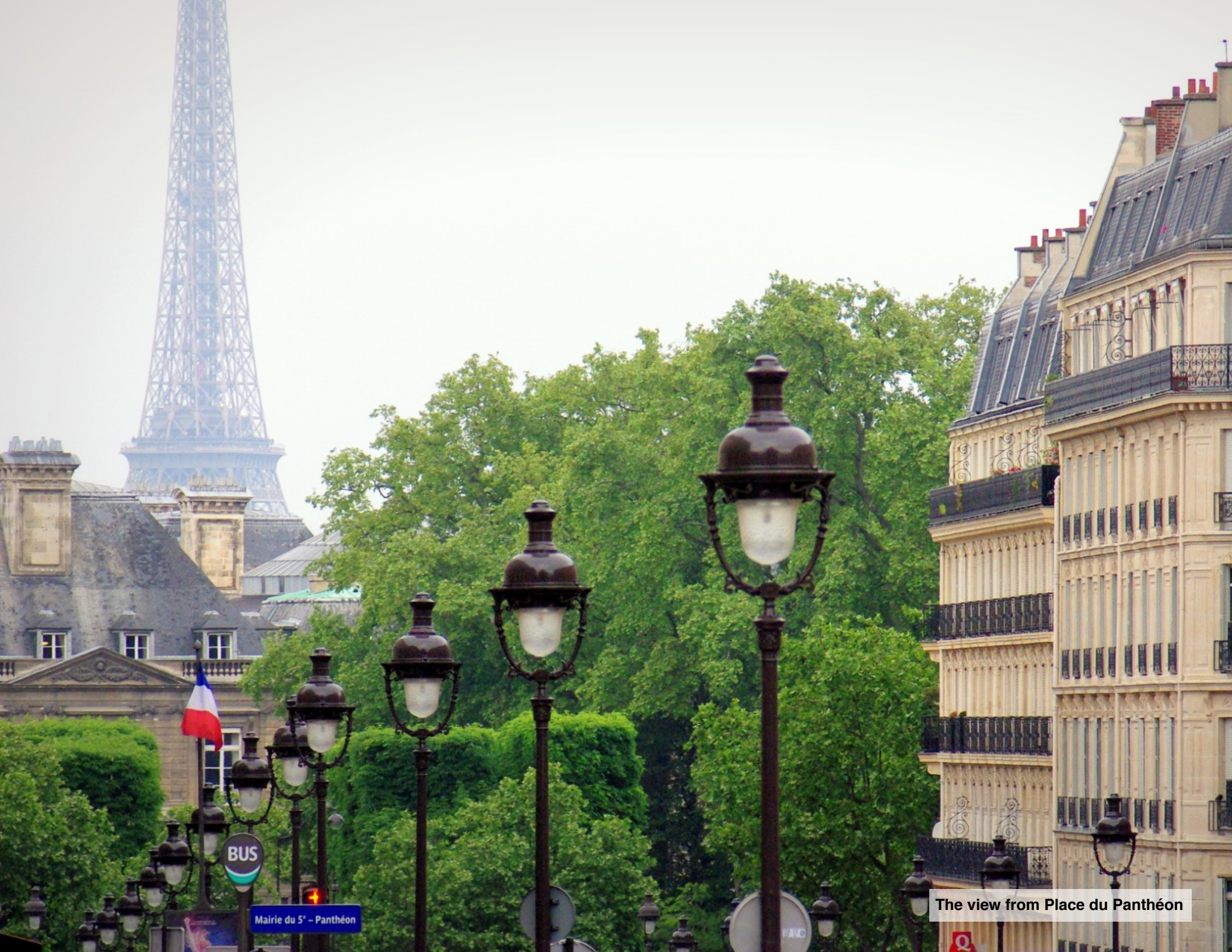
The view from Place du Panthéon