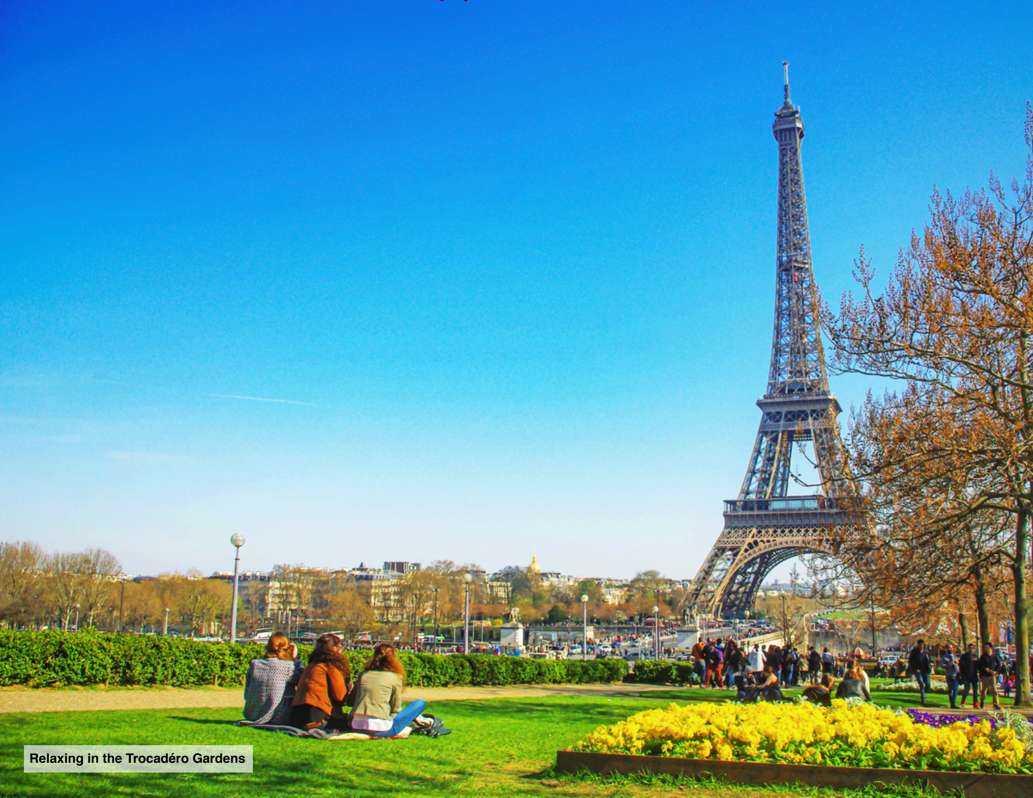
Relaxing in the Trocadéro Gardens