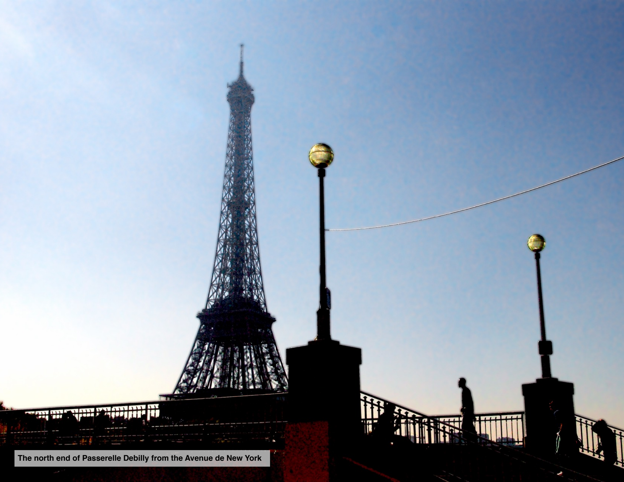
The north end of Passerelle Debilly from the Avenue de New York