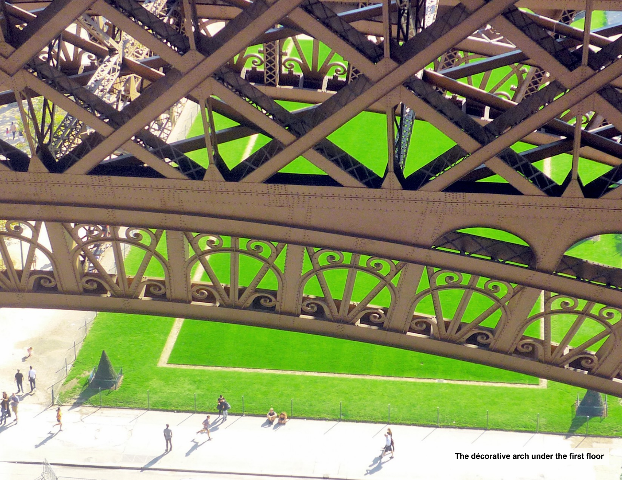
The décorative arch under the first floor