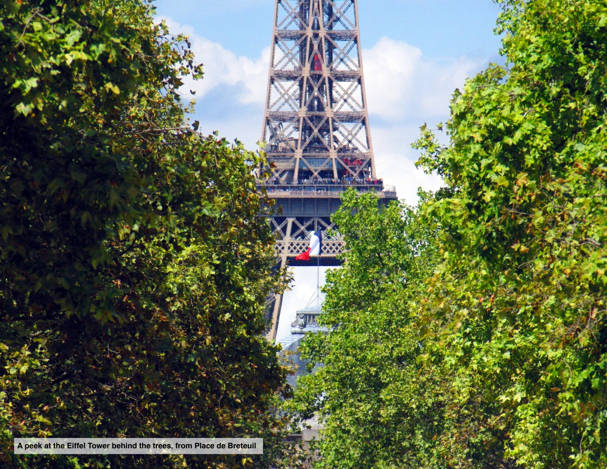
A peek at the Eiffel Tower behind the trees, from Place de Breteuil