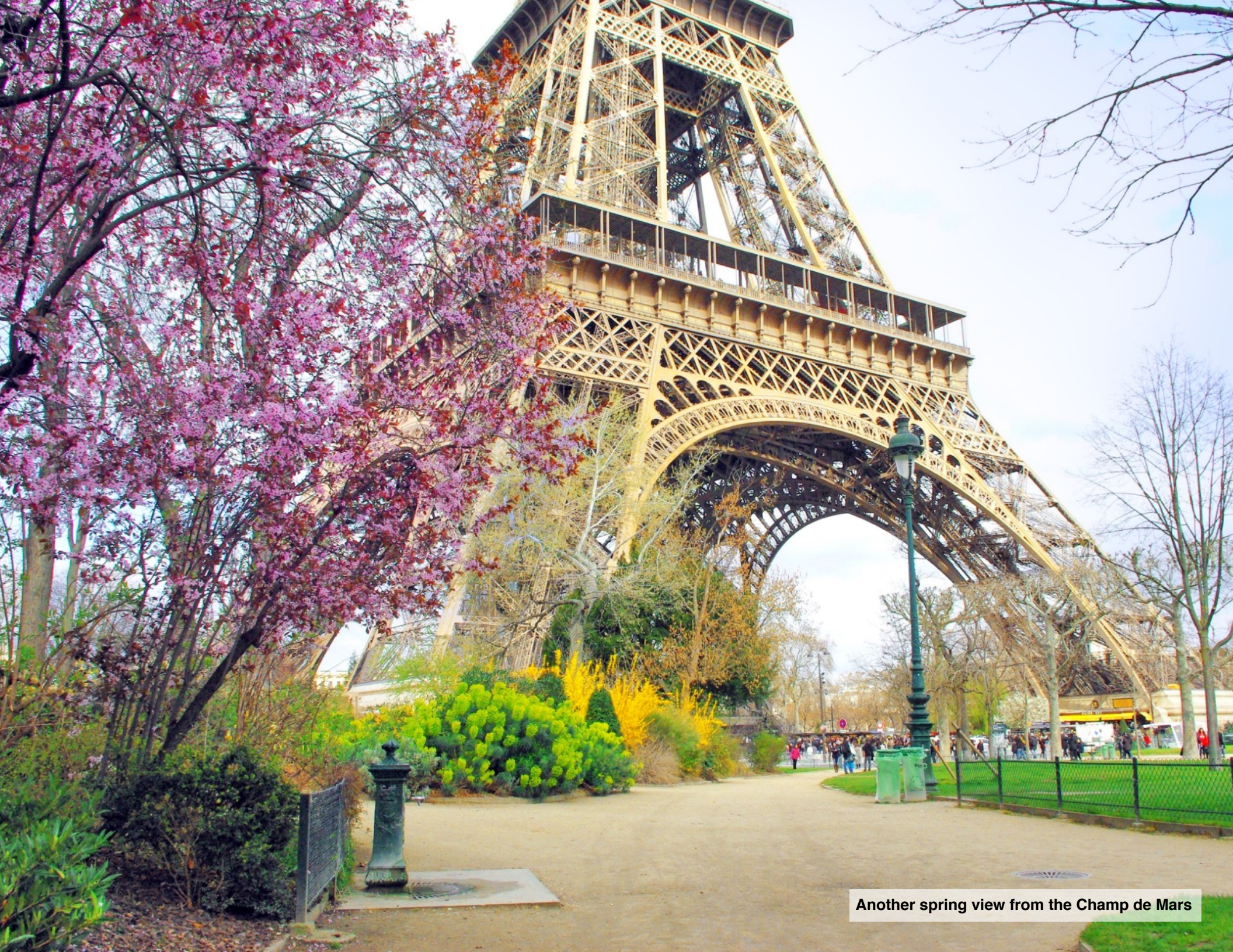
Another spring view from the Champ de Mars