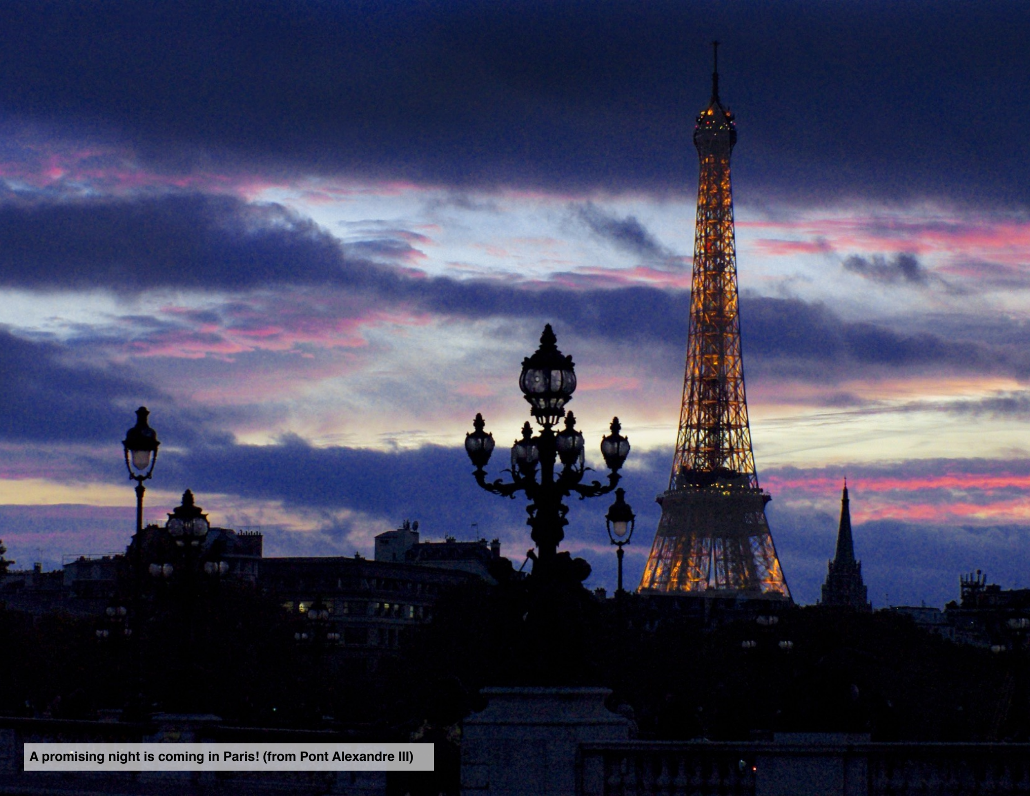
A promising night is coming in Paris! (from Pont Alexandre III)