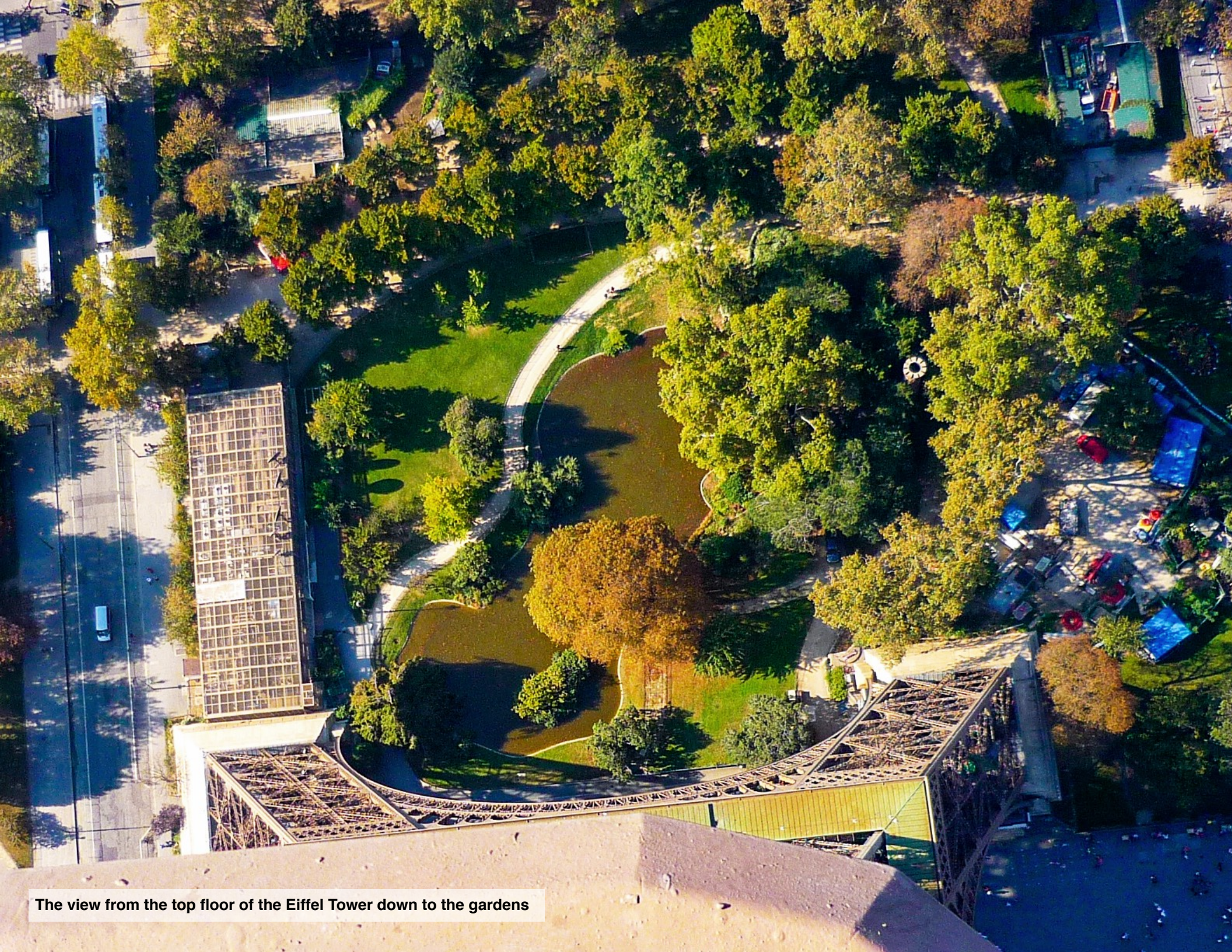
The view from the top floor of the Eiffel Tower down to the gardens