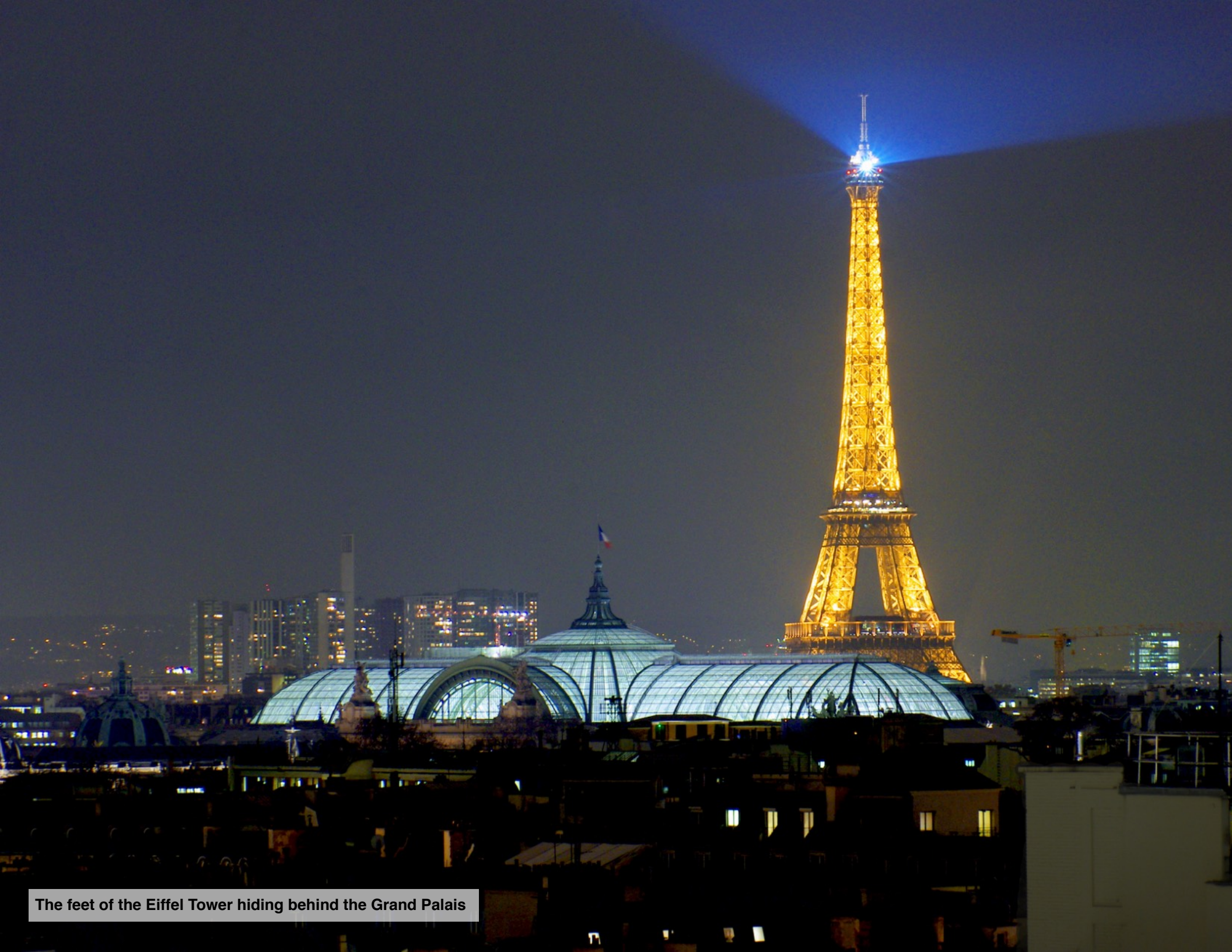
The feet of the Eiffel Tower hiding behind the Grand Palais