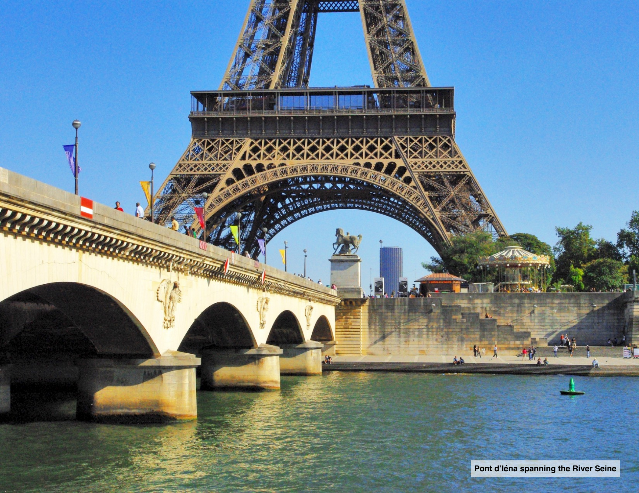
Pont d'Iéna spanning the River Seine