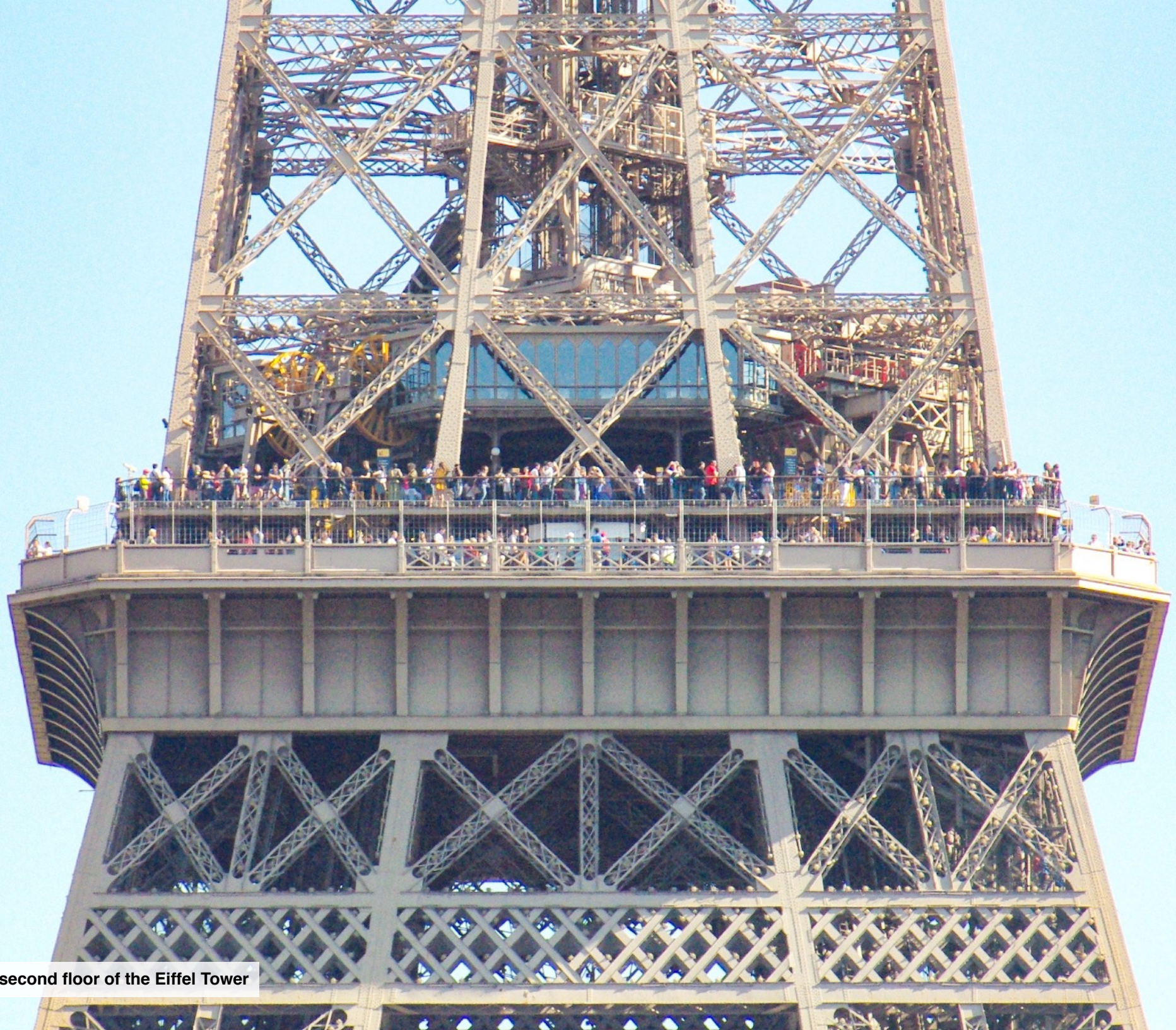
The second floor of the Eiffel Tower