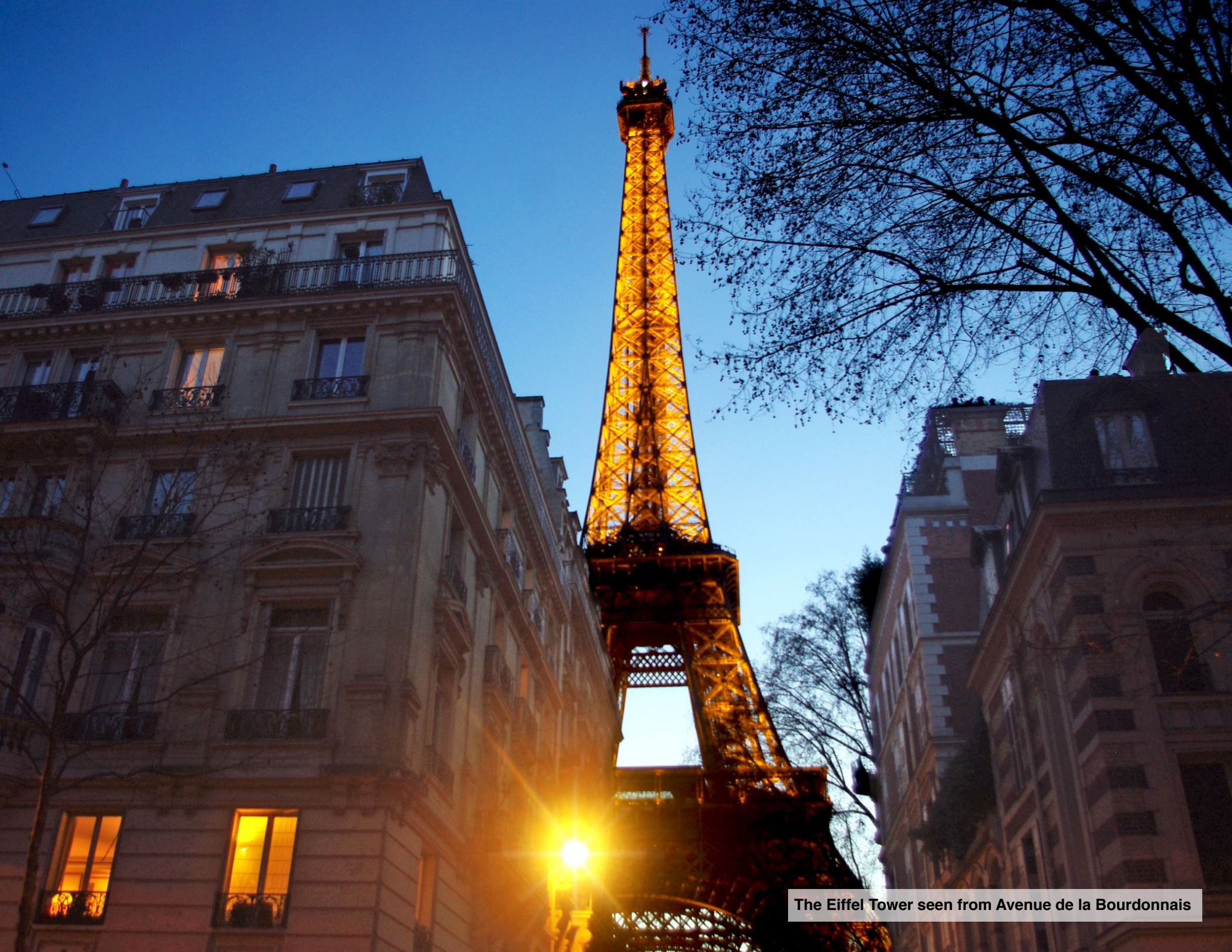
The Eiffel Tower seen from Avenue de la Bourdonnais