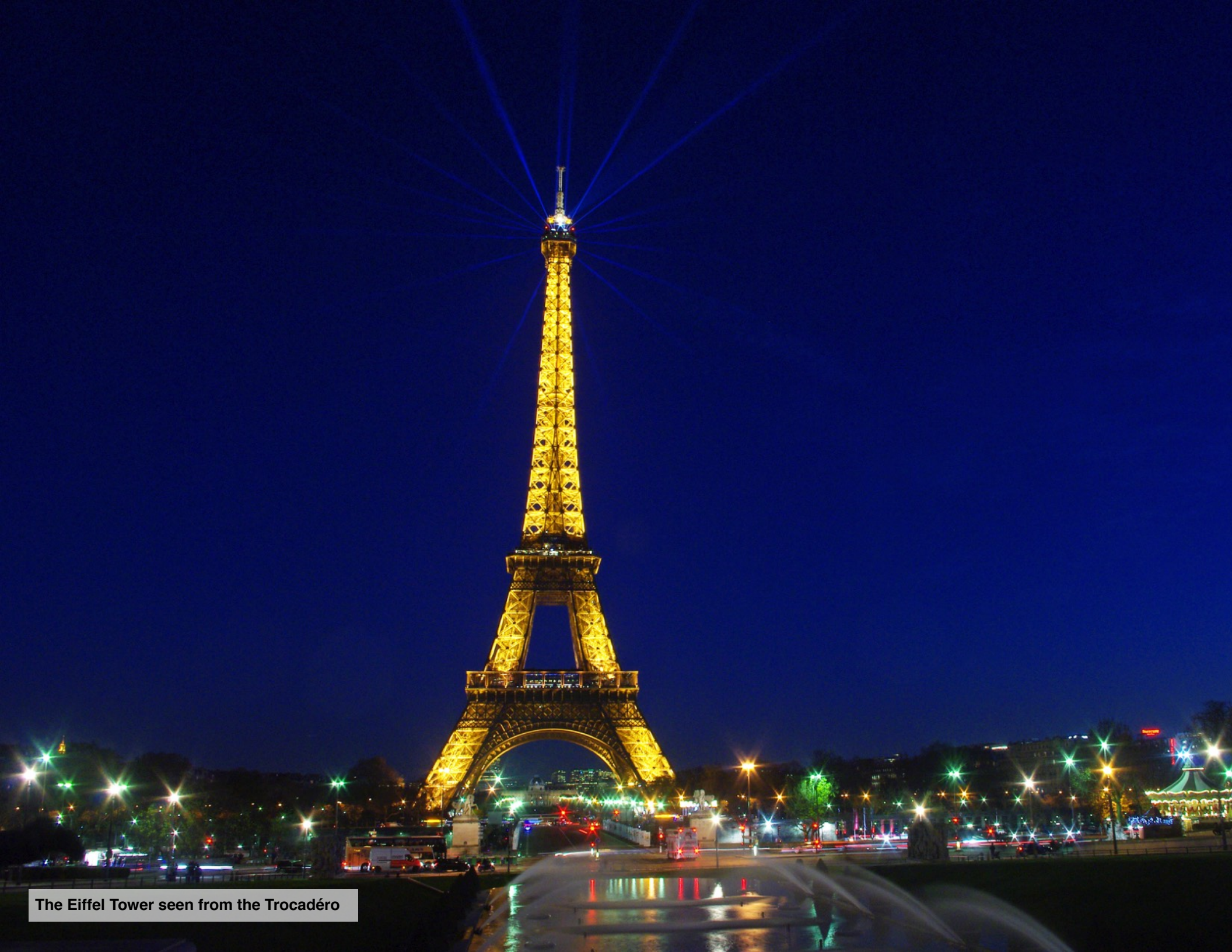
The Eiffel Tower seen from the Trocadéro