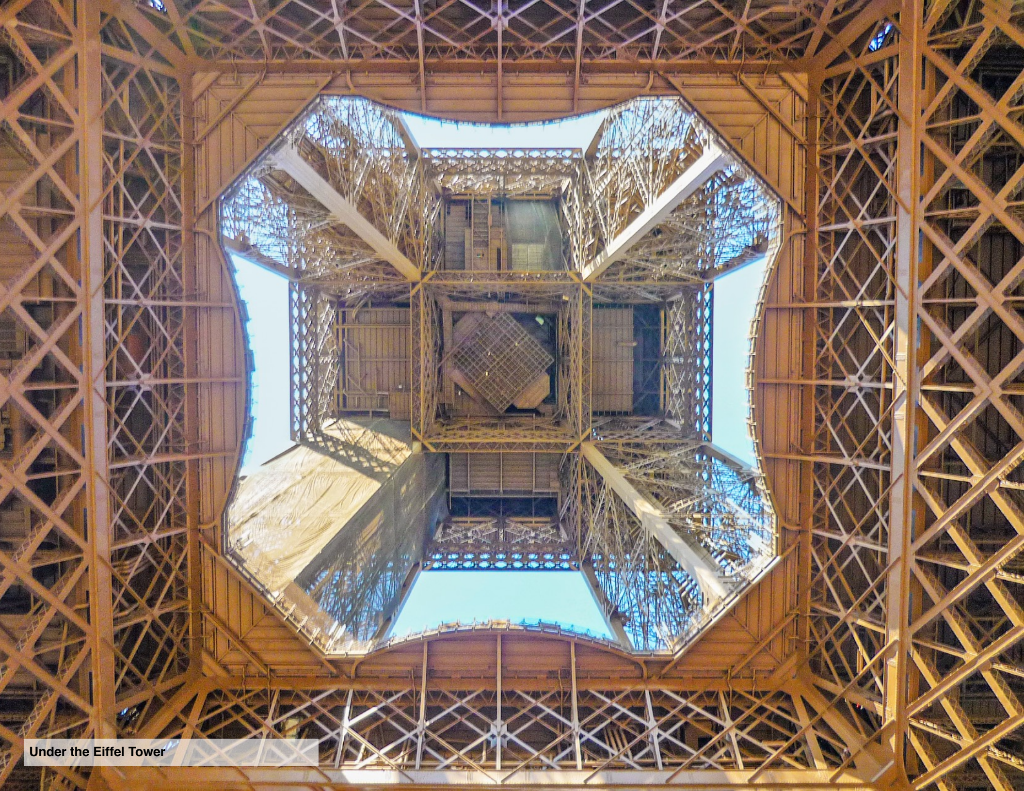
Under the Eiffel Tower