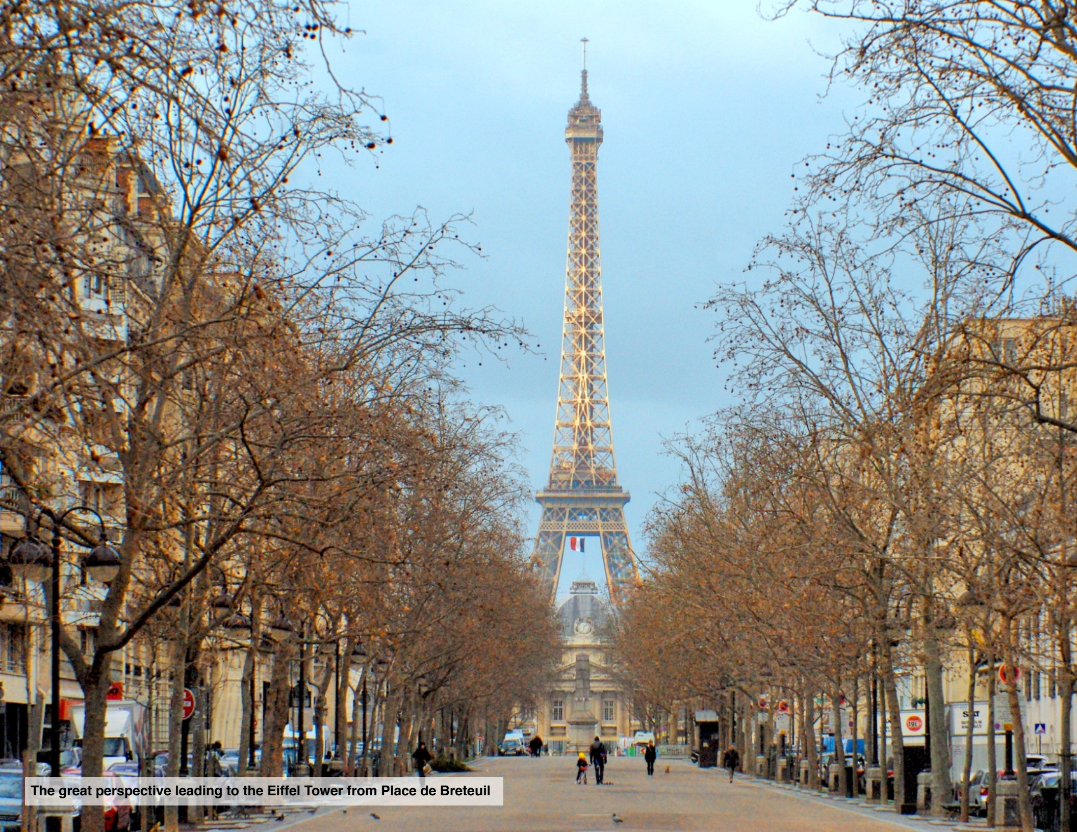
The great perspective leading to the Eiffel Tower from Place de Breteuil