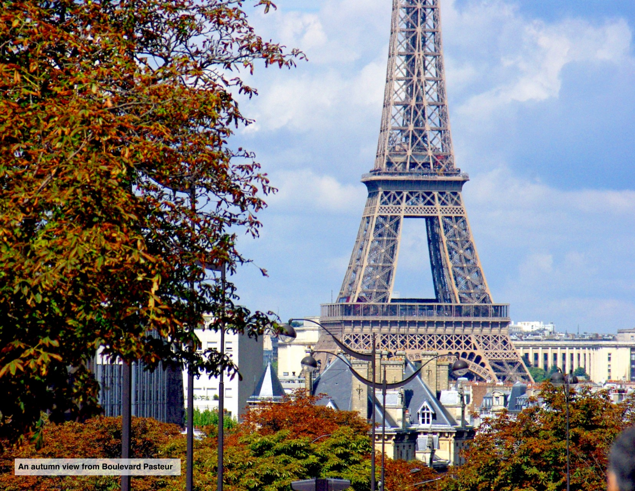
An autumn view from Boulevard Pasteur