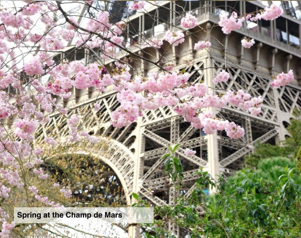
Spring at the Champ de Mars