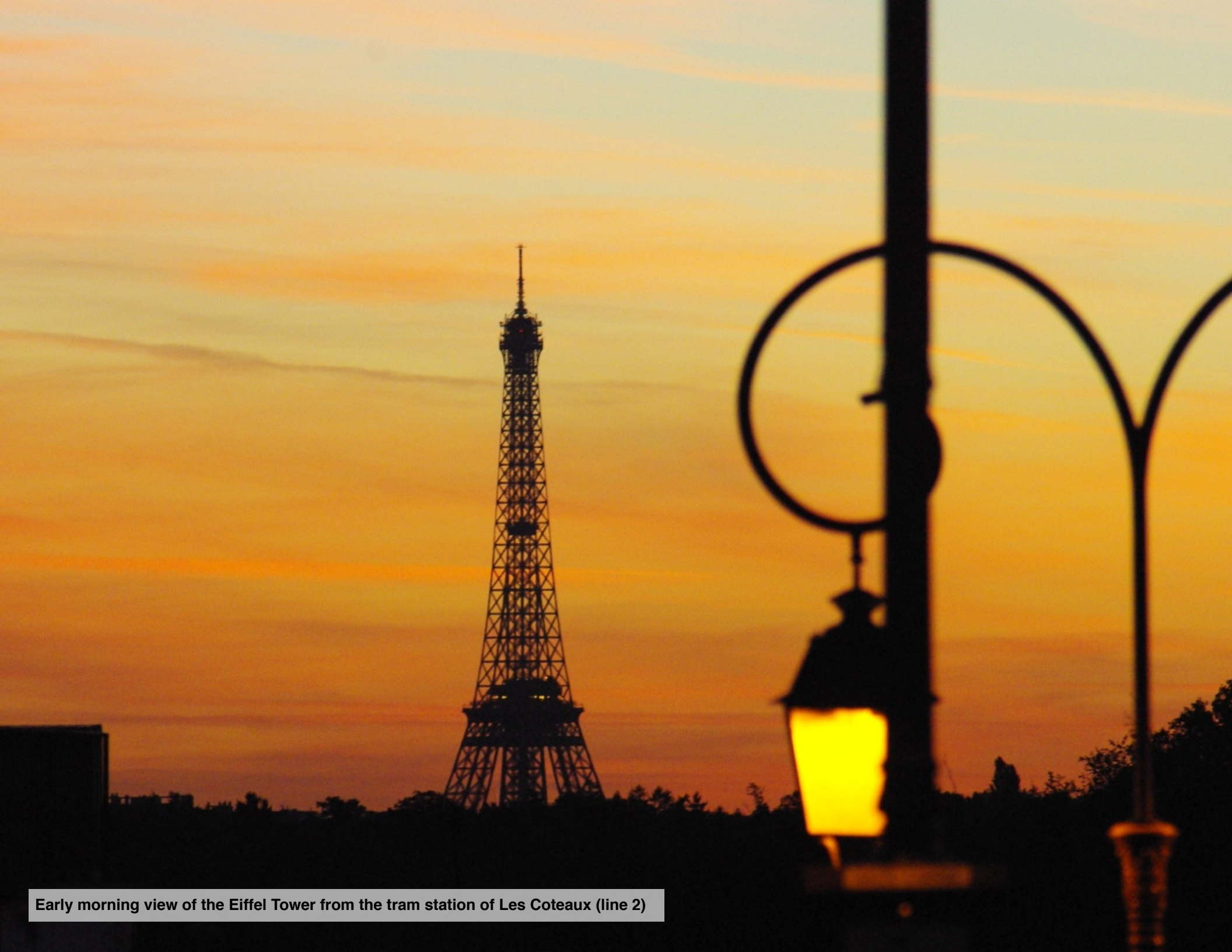
Early morning view of the Eiffel Tower from the tram station of Les Coteaux (line 2)