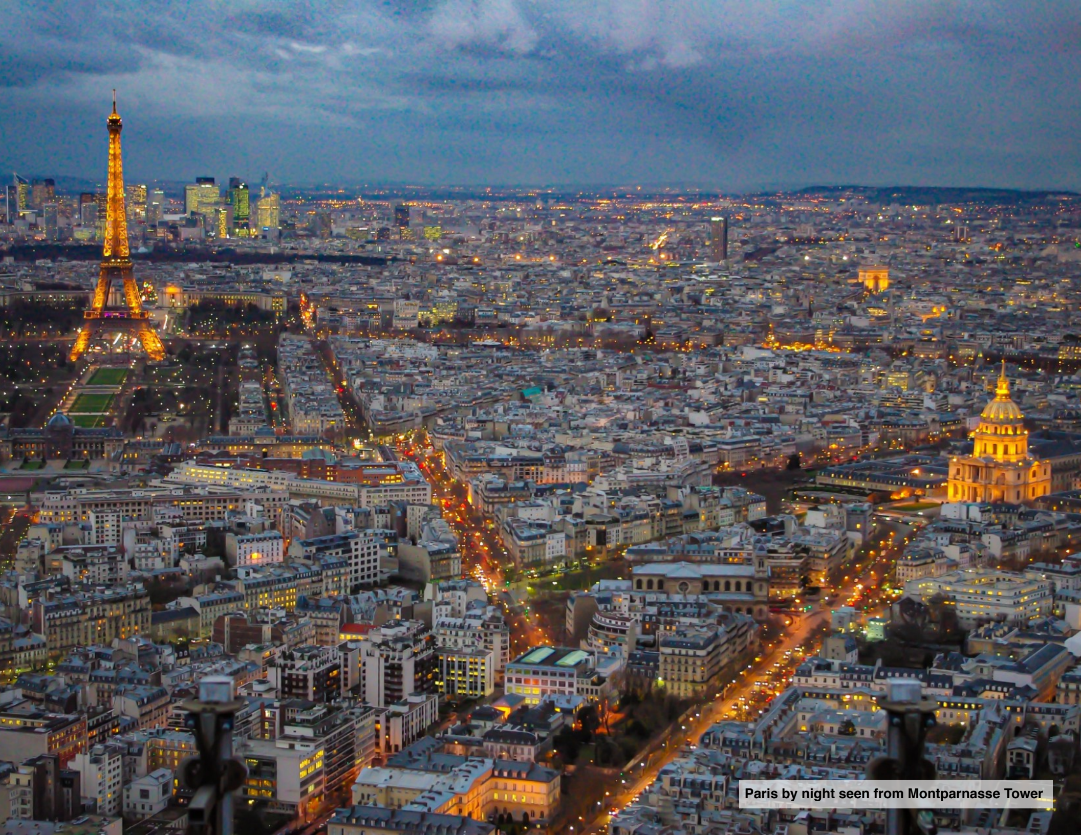
Paris by night seen from Montparnasse Tower