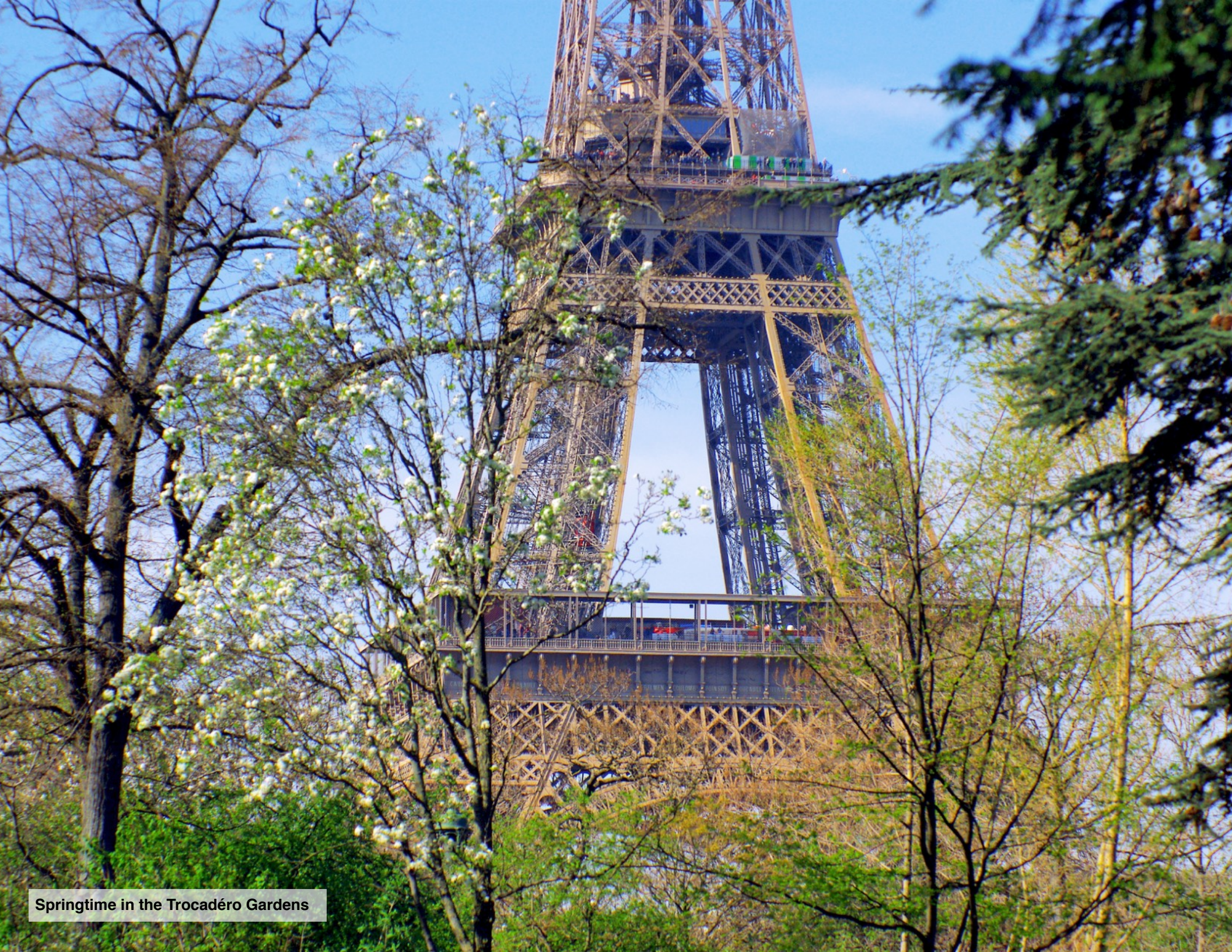
Springtime in the Trocadéro Gardens